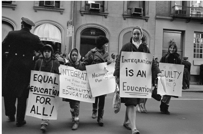
Eddie Hausner/The New York Times

The lack of incidents with police and counterprotesters also served as a positive sign for the boycott. As reported in the New York Times , “pickets were courteous and disciplined. The police were equally polite, and there was a minimum of friction between the two groups.” 110 The lack of troubling incidents was crucial to the group and event’s success because anything less and the protesters would have been surely labelled as rioters or people intent on causing trouble and disturbing the peace. The lack of violence further legitimized the picket’s mission and provided the civil rights groups who had organized the event a new level of credibility. It was a far cry from the injuries that BOE leaders had predicted would rise out of the protests. In particular, when children and parents alike protested at the Brooklyn BOE office, seldom incidents were reported, with “the absence