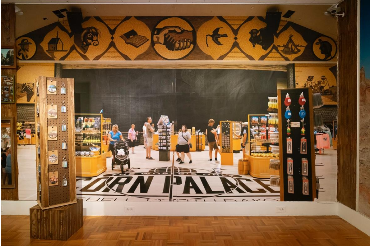
Plate 5: Corn Palace Gift Shop , exhibition installation, 2020.