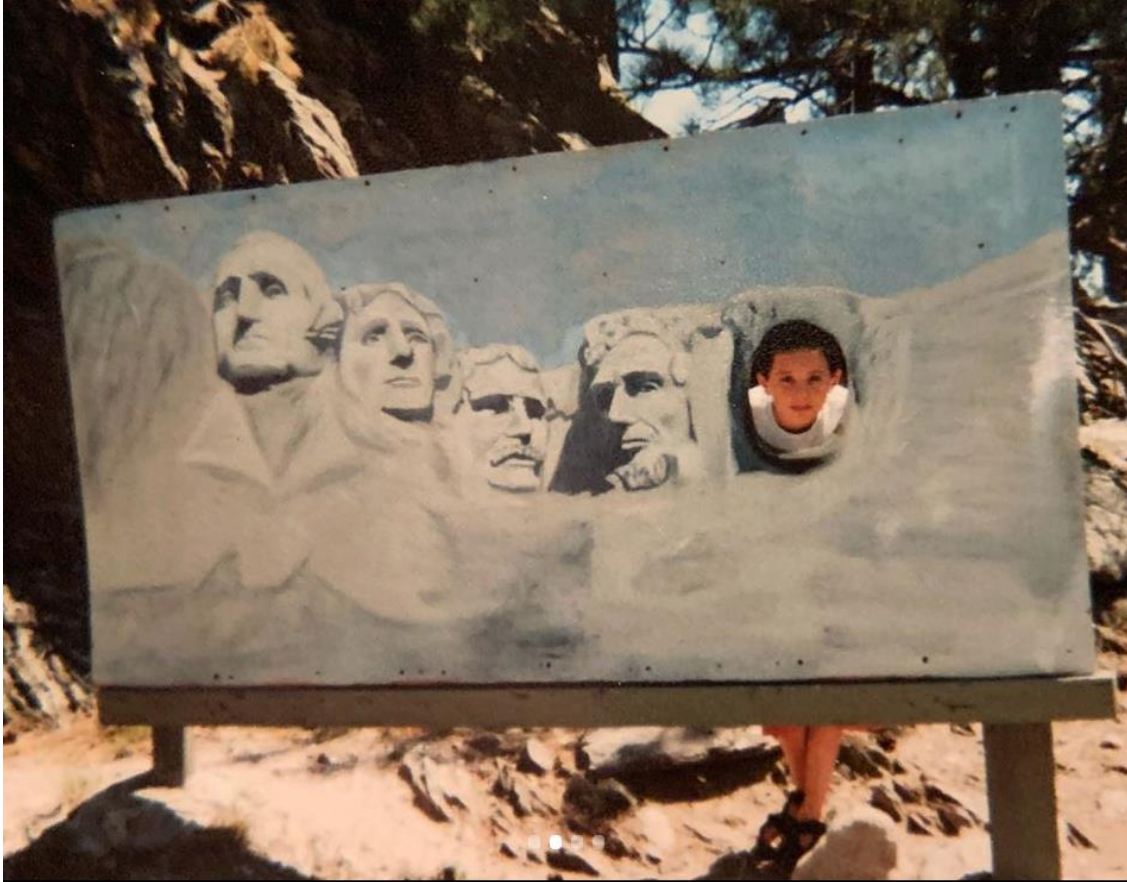
Figure 7: Mount Rushmore Photo-Op, Rickett Family Archives, 1999.

reproductions of historical events, and souvenirs reminiscent of pioneers including coonskin caps and knives. Some attractions include recreations of specific events, like cowboy shootouts or photo-ops for tourists to take part in the times.