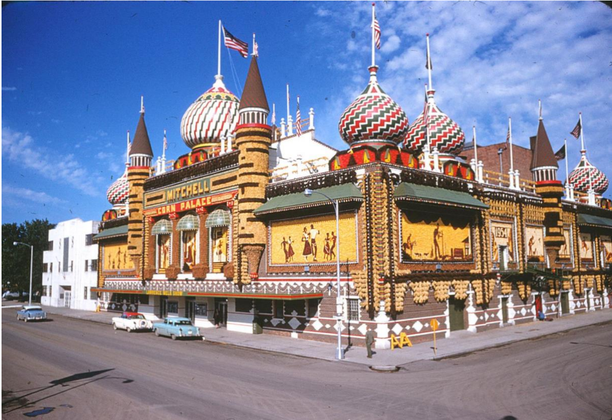
Figure 5: The World's Only Corn Palace, Mitchell, South Dakota, 1954.