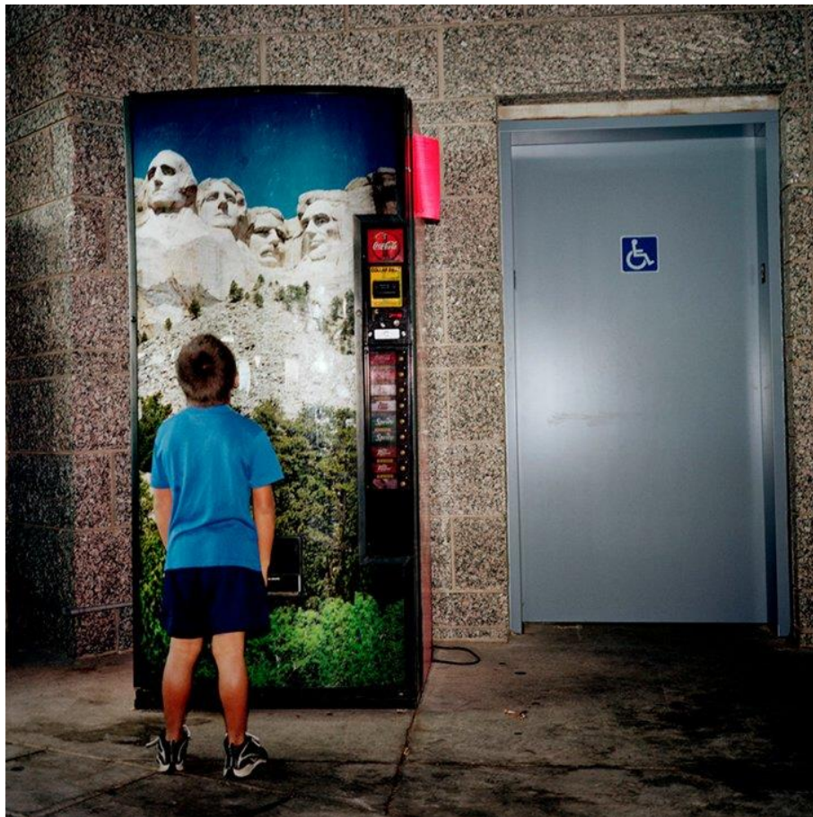
Figure 8: Greta Pratt, Using History , 2005.

keep their land secured, creating this dynamic. The story of Custer's Last Stand, or the Battle of Little Bighorn, where the U.S. Army was defeated by the Sioux, reinforces the stereotype of the Indian savage as compared to the heroic frontiersman. Contemporary Apsáalooke artist, Wendy Red Star, confronts the romanticized and stereotyped images of Native Americans in her work, both making fun with these representations in Four Seasons and educating the general public in tribal history in Medicine Crow and the 1880 Crow Peace Delegation .