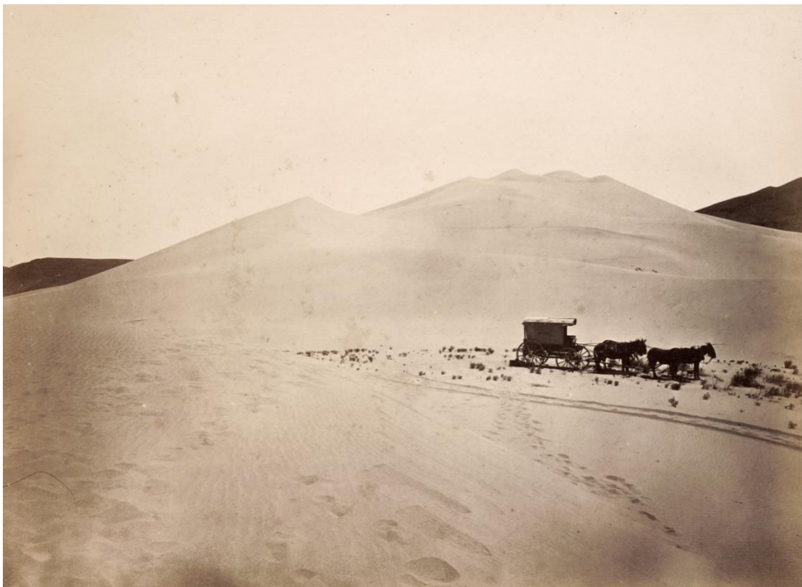
Figure 2: Timothy O'Sullivan, Sand Dunes, Carson Desert, Nevada , 1867.

American history is lined with aspects of the Great American Roadtrip. There is an idealism within American culture, associated with freedom, where individuals have the ability to travel anywhere in the country, experience different cultures and regions, by way of their car. The epitome of this is Jack Kerouac's On the Road , where a man based in New York City was tired of urban spaces and wanted to experience real America with real people. The general idea of road trips is strongly linked with photography and Westward expansion.