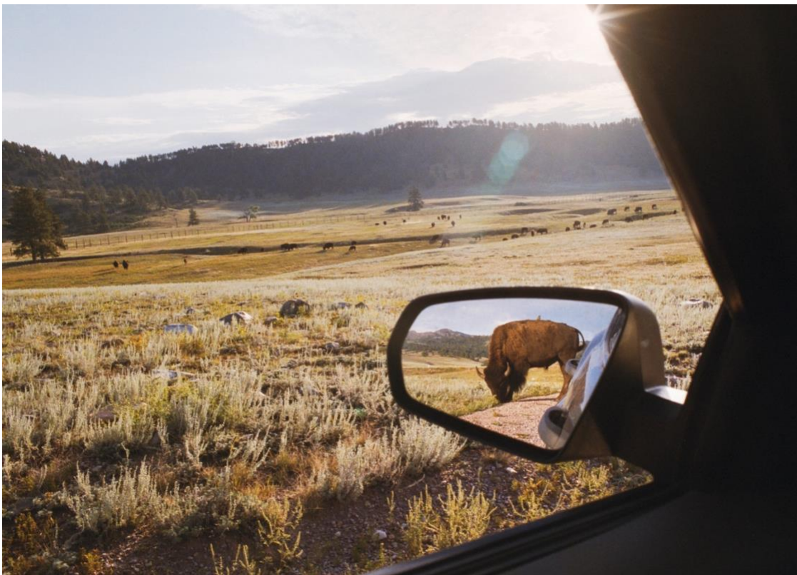
Figure 10: Rebecca Norris Webb, Rearview Mirror , 2005.

While many of the images in Wish You Were Here are busy, they also allude to the overwhelming isolation and quiet in the Great Plains. The roadside attractions are miles apart and the drive to get there is lined with the prairie and farming fields. In one day, from Rapid City, South Dakota to Sutherland, Nebraska, we visited Christmas Village, the City of Presidents, Dinosaur Park, Chimney Rock, Carhenge, the Rural Rest Area (complete with a toilet!), Front Street, and the UFO Water Tower across 306 miles. While this was one of our busier days, it can seem like there is nothing for miles. Growing up in this region, I relate to Gretel Ehrlich's description of openness of a landscape in The Solace of Open Spaces as "...closer to home we might also learn how to carry space inside ourselves in the effortless way we carry our skins." 17