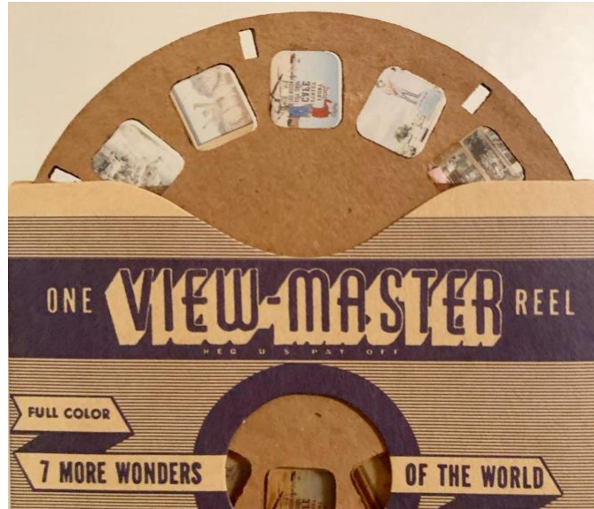
Plate 8: Viewfinder Reels , detail shot, 2020.