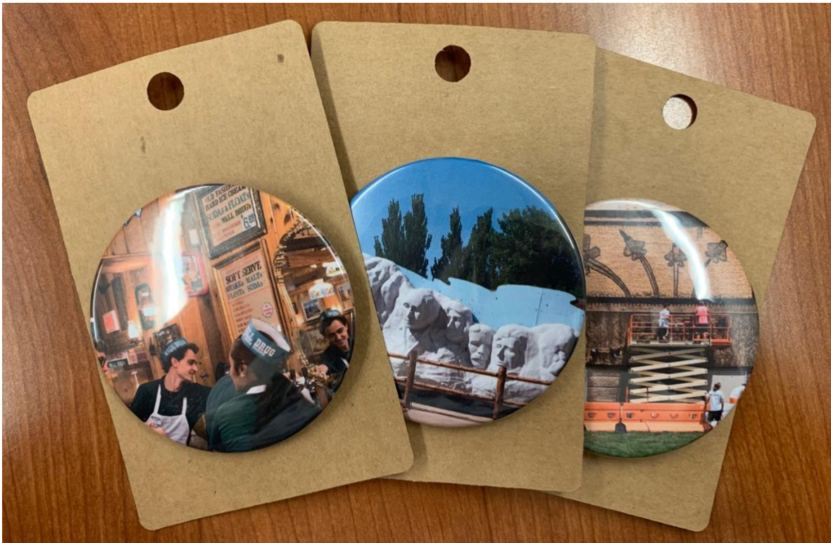
Plate 6: Buttons , detail shot, 2020.