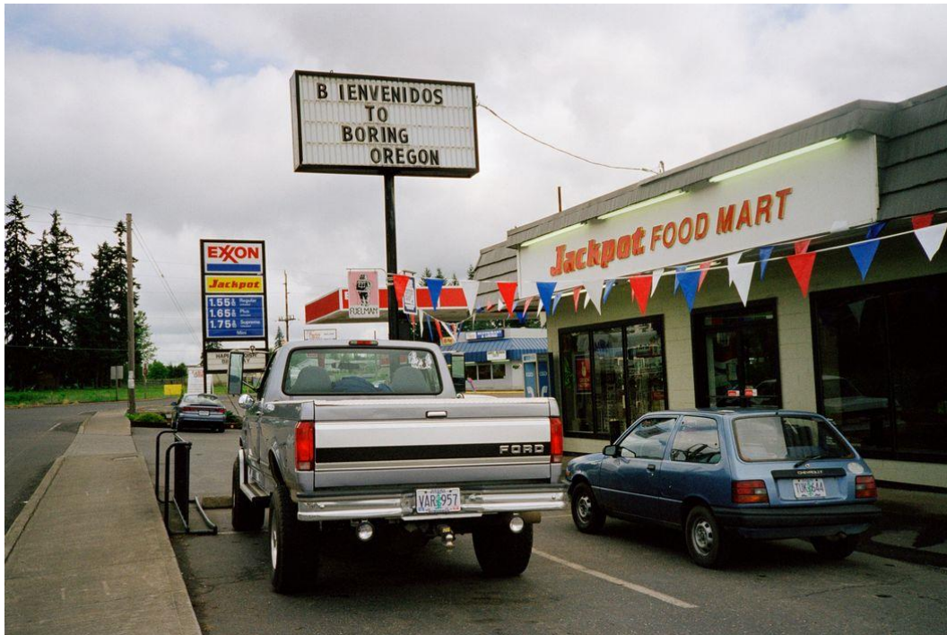
Figure 6: Martin Parr, Boring Oregon , 2000.

Crazy Horse Memorial captures the traditional tourist experience with tourists looking at the monument from the constructed viewing point.