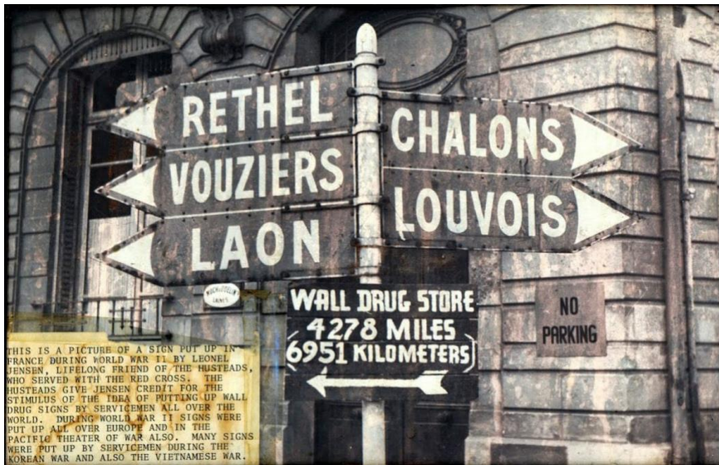
Figure 3: Wall Drug Sign, France, 1940.

Where the Heck is Wall Drug?, Wall, South Dakota