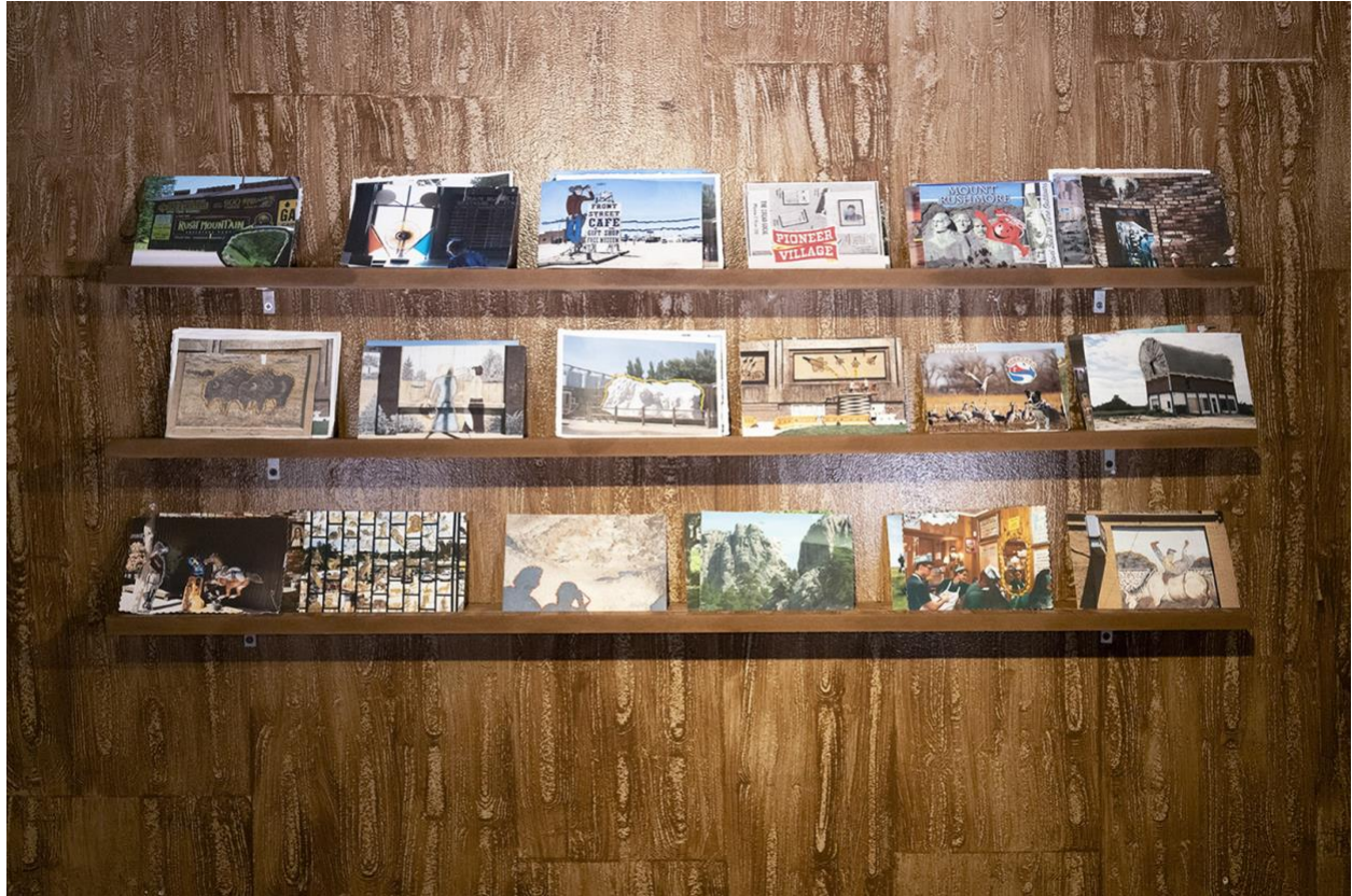
Plate 10: Postcard Display , exhibition installation, 2020.

As with any gift shop, souvenirs are for sale representing the place. The souvenirs within the installation include keychains, magnets, buttons, and postcards. They all feature images from Wish You Were Here which are not the typical picturesque representations. These souvenirs show tourists interacting with these places, allowing the gallery viewers to engage with how the tourists engage. Keychains, magnets, and buttons are some of the most common souvenirs found in any gift shop.