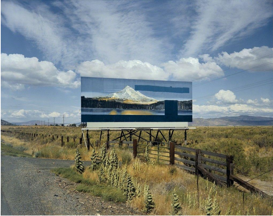
Figure 11: Stephen Shore, Uncommon Places. U.S. 97, South of Klamath Falls, Oregon, July 21, 1973, 1973.

Photographer Stephen Shore largely explores these ideas in his work Uncommon Places. U.S. 97, South of Klamath Falls, Oregon, July 21, 1973 features a billboard of a mountain range in the center of a picturesque landscape, playing with the ideas of real and fake, man-made and natural, the epitome of American vernacular.