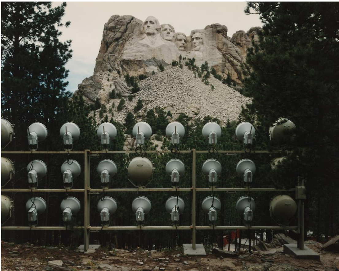
Figure 9: Joel Sternfeld, Mount Rushmore National Monument, Black Hills National Forest, South Dakota, August 1994, 1994.

The mention of roadtrips usually brings back first memories with family on cross-country adventures; if not specifically, then the memory of the movie Vacation . Nostalgia evokes specific feelings, usually regarding sentimentality and reminiscing, which can affect interpretation of events and memories. Roadside attractions use this to bring tourists in, hoping they will be reminded of their childhood or years before. In general, being nostalgic tends to be yearning for happier times, where memory tends to recall positive aspects rather than the whole. These roadside attractions use this when discussing their histories and folklore of the region, where truths are twisted or overlooked.