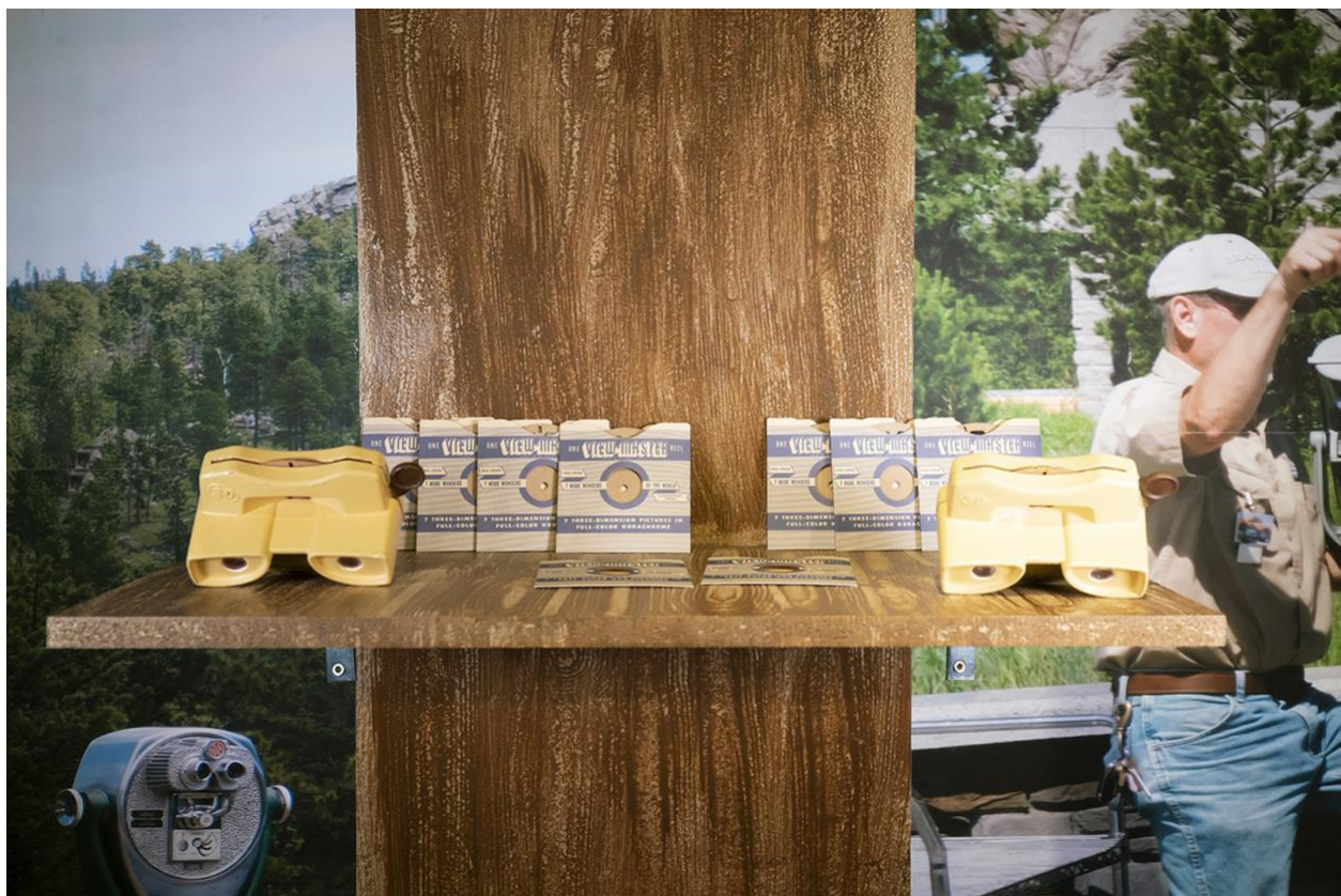
Plate 7: Viewfinders , detail shot, exhibition installation, 2020.

Roadside attractions usually have a primary viewing point that is the best for photographs or allows tourists to solely focus on the attraction. These created viewpoints usually get rid of any distractions, like a fast-food sign in the background or a surrounding wall. One way many attractions do this is by including tower viewers for distance viewing. Relating to the perfect view, Wish You Were Here includes images on viewfinders. Viewfinders are preceded by the stereograph, where two images are seen through each individual eye creating the illusion of space. 22 These largely featured tourist spots or street scenes but many satirical scenes were also popular. The stereograph revolutionized the photography industry, allowing people to travel to these places without leaving their homes. These viewfinders include images from the series sequenced into mini-series focused on place or iconography. The mini-series gives the viewer a specific, curated, and inauthentic view.