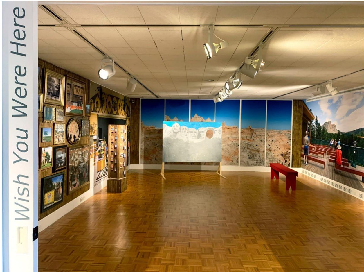
Plate 3: Wish You Were Here , exhibition installation, 2020.

Wish You Were Here: Legends of the Great Plains uses installation-based materials to emulate the roadside attractions and gift shops. The exhibition is influenced by the aforementioned themes. The gallery transforms into a gift shop and attraction in itself. The photographs line the walls, exploring a myriad of places along the Midwest highways and how tourists engage with them. The viewer takes on the role of a tourist within the gift shop. According to Claire Bishop, the role of the viewer “constitutes the subject of that experience.” 20 The space should have a Midwestern, kitschy aesthetic, a cross between a gas station and Grandma’s house. Referencing simulacra, the exhibition is based on the idea of roadside