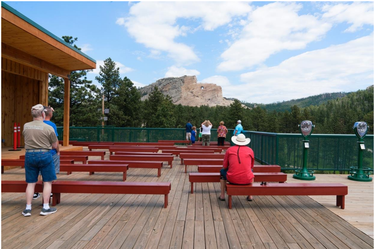
Plate 1: Onlookers at the Unfinished Crazy Horse Memorial , Archival inkjet print, 2019.

The Beat generation, a group of literary artists of the 1950s, inspired a new love for the Great American Roadtrip. Jack Kerouac's On the Road articulated the feeling and experience of traveling across the country. Robert Frank, a Swiss photographer, traveled to the United States with a Guggenheim Fellowship in 1955 and 1956 resulting in The Americans , a revolutionary book in the history of photography and America. 16 Frank did not capture Americans in a romanticized light but focused on the actual existence of American life. Frank inspired a new generation of photographers with this now archetypal style.