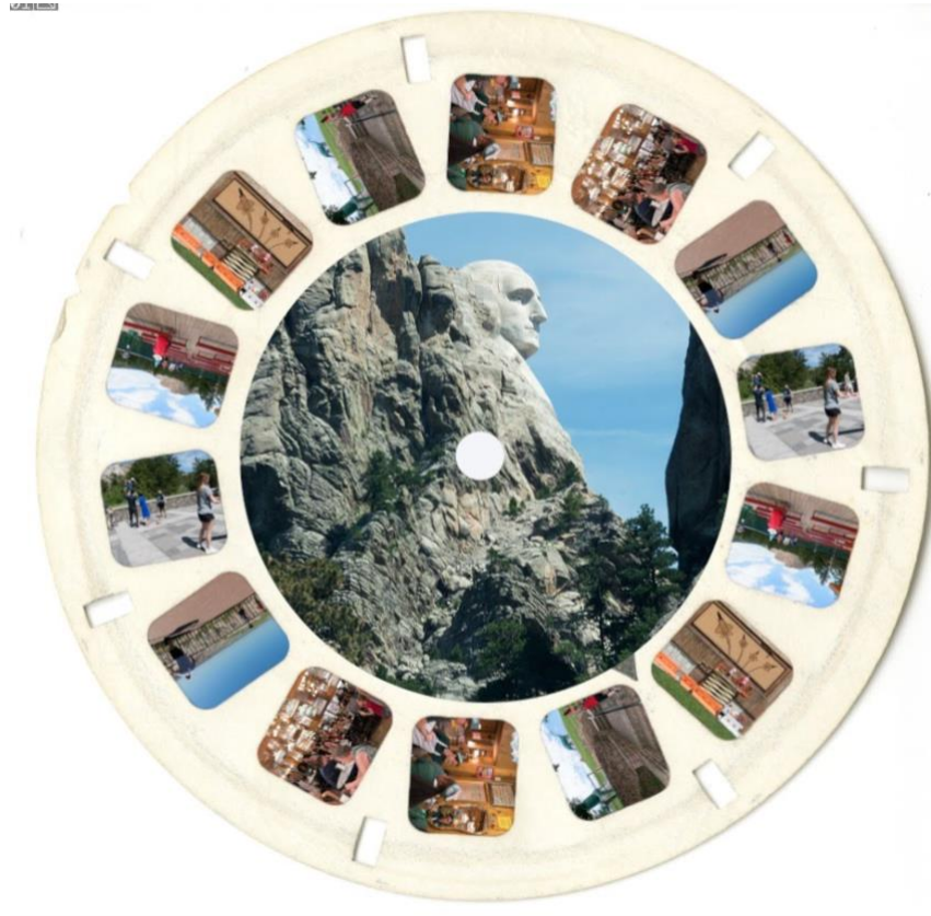
Plate 9: Viewfinder Reel , digital mock-up, 2019.