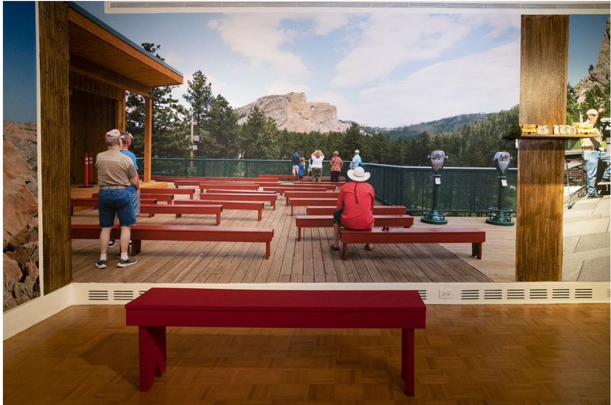
Plate 4: Onlookers at the Unfinished Crazy Horse Memorial , exhibition installation, 2020.

attractions across the Midwest or images rather than a recreation of specific places or spaces. While the images are real places, this transference from real to image to object allows viewers to create new connections between place and images.