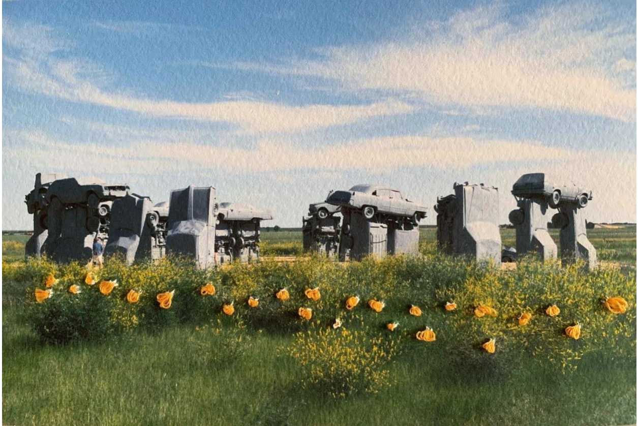
Plate 11: Carhenge with Goldenrod , Postcard, 2019.

Postcards have a long history of communication within the world of photography. Before telephones were widely used, notes and letters were used for long-distance communication. Photographic postcards featured tourist attractions, news events, comedic illustrations, and erotic imagery to be sent to loved ones. Today, postcards are still used largely to share vacation spots and small notes to family. Wish You Were Here plays with the ideas of traditional aesthetics and mass-production of postcards. Using the images from the series, postcards are sent to friends and family with “Wish you were here!” signed. The postcards include hand-stitched embroidery emphasizing part of the image, either drawing focus to the tourists or the attraction. Since they are sent through the postal service, the actual stamps and general travel evidence are included.