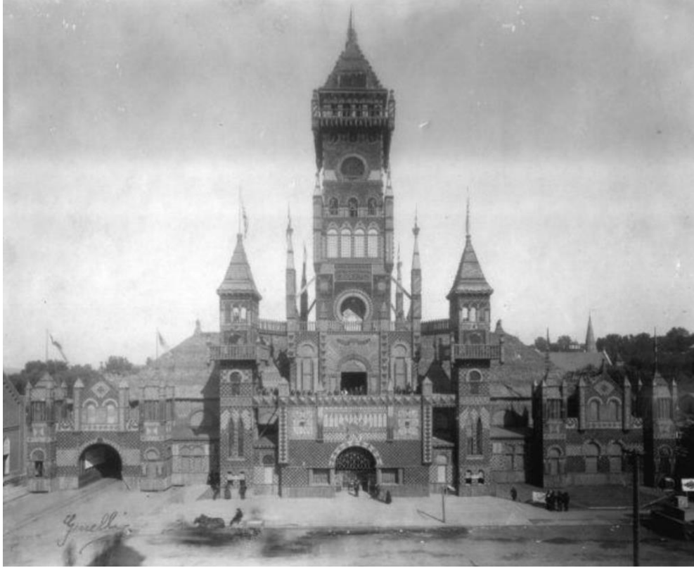
Figure 4: Sioux City Corn Palace, Sioux City, Iowa, 1889.

More than 500,000 tourists see the Corn Palace each year in Mitchell, South Dakota. Branding themselves as the “World’s Only Corn Palace,” the attraction creates new designs each year around a different theme. Using thirteen different colors and shades of corn, the murals are stripped at the end of August and the new designs are completed by October. 7 It doubles as a community center, hosting high school basketball and community theatre. In fact, one of my favorite trips to the Corn Palace in my teenage years was participating in the Friend de Coup Mitchell Show Choir Competition of 2009.