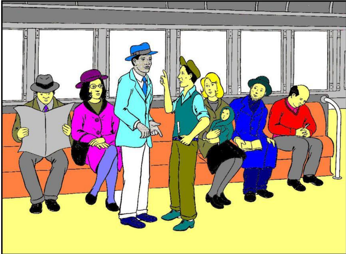
Figure 3.2: Allport and Postman's illustration of the role in expectation in memory

differs in important respects from the drawing itself. According to Allport and Postman (1958), many people recall the drawing as showing the knife in the black man's hand; clearly this is an incorrect recollection.