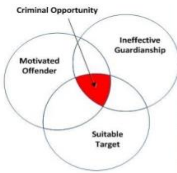
Figure 1: Opportunity theory

RAT hardly clarifies as to how places contribute to crime. According to Wilcox, Land and Hunt (2003), focusing on the RAT implies that crime can be explained by whatever amount or rate of occurrence, location and distribution across social and physical space of the criminal acts. This analysis is achieved through applying what is referred to as the ‘criminal opportunity context’. By definition, the criminal opportunity context refers to “the social and physical individual and environmental circumstances that affect the convergence in time and place of a motivated offender, a suitable target, and absence of capable guardianship” (Wilcox, Land, & Hunt, 2003, p. 15). This can be illustrated diagrammatically as follows: