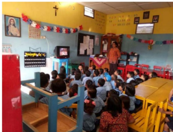
Picture 1.2 Children are watching St. Joseph Kindergarten Television Broadcast

Character values are believed as a solid support in the life of the nation and state. The collapse of a country is suspected by the character values weakening in the lives of its people. The National Education Ministry implemented character education at all levels of education, including in Early Childhood Education institutions. Character education in Early Childhood Education institutions emphasizes the habit in daily life. In other words, the character building in early childhood is not only in the form of learning but it can packaged through technology and children's daily activities, it can be seen in picture 1.2, as follows: