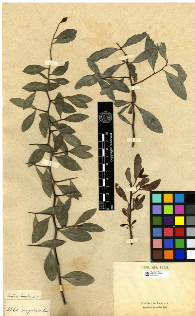
Figure. 1. Neotype of Celastrus senegalensis Lam. (≡ Maytenus senegalensis (Lam.) Exell), P (2-D code P00295391).

Geneva any specimen of this taxon, corresponding to the protologue]. In this sense, in 1983 the specimen was on loan cf. the round stamp on the right of Sebsebe’s determinavit: “7883 / 22” meaning loan number 78 of the year 83, 22nd sheet. Güemes & Crespo (1990: 86) published a new combination and a new rank, but no comment was provided on the nomenclatural type.