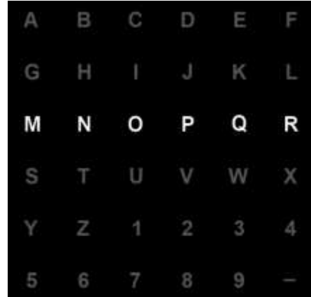
Figure 1. Common P300 speller matrix proposed by Farwell and Donchin. It consists of a 6 x 6 matrix of grey letters and numbers and black background.

The objective was to evaluate the feasibility to change the configuration of the P300 speller interface, then, it was necessary to check the different options available on each platform in order to set the configuration of the final speller. Once established the final speller layout, the participants had to transform the speller of reference (the same than the one first developed by Farwell and Donchin, see Figure 1) into the final proposed speller. Some days before the test, a manual of each platform was provided to the subjects. These manuals were specially made for this experiment and included only instruction regarding how to make the different changes concerning the speller layout.