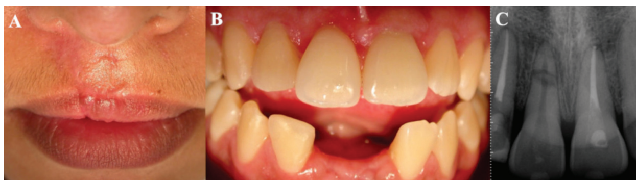
Fig. 1: A) Scar on the right upper lip due to trauma. B) Absence of teeth 31 and 41, avulsed. C) Initial x-ray suggestive of apical horizontal fracture.

After the patient's free and informed consent, a coronary access was performed under absolute isolation by means of dental floss ties and a Top Dam® gingival barrier seal (FGM, Joinville, SC). The working length was precisely determined by the CBTC, at 17 mm, with the palatal face of the tooth as the apical end the (Fig. 2A). Mechanized instrumentation was performed using the Protaper Next system up to the X5 file (Dentsply Tulsa Dental Specialties, Tulsa, OK, USA). Copious irrigation with 5.25% sodium hypochlorite was performed and during each instrument exchange using a 5 mL Luer syringe equipped with NaviTip 30 gauge needles (Ultradent Products Inc., Indaiatuba, SP), inserted into the canal up to 2 mm from the WL. After complete instrumentation, the canal was irrigated with 5 mL of ethylenediaminetetraacetic acid (EDTA, Formula and Action) at 17% followed by application of an intracanal calcium hydroxide medication (Ultracal, Ultradent, South Jordan, UT) for 10 days (Fig. 3A). After the placement of a delay dressing, a slight wear was made on the incisal edge of the tooth. When no signs and symptoms were observed, a 4 mm apical plug was created using Bio C repair Bioceramic cement (Angelus, Londrina, Paraná), with the aid of condensers (Odous De Deus, Belo Horizonte, Minas Gerais, Brazil). Subsequently, the two coronary millimeters were filled with thermoplastic gutta percha, inserted