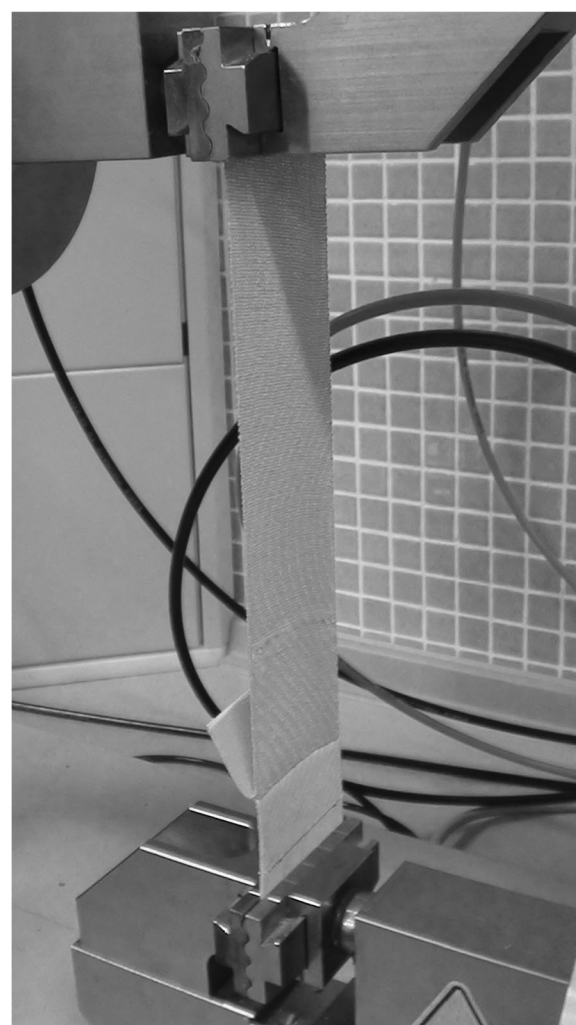
Fig. 2 Dynamometer Zwick/Roell, model Z005 (Ulm, Germany) during the adherence test of one red tape. The tape is adhered on a piece of untanned sheepskin