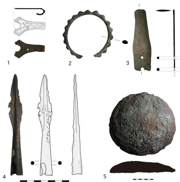
Figure 2. Example of most representative artefact's typology from the Rochelongue site. Ornaments (1 buckle belt and 2 bracelet); Weapons (3 sword and 4 spearhead) and semi-raw metal (5 copper ingot).

The Launacien appellation applied to bronze hoards typically implied a recycling purpose linked to an indigenous culture of primarily continental inclination 40 . With the discovery of the underwater site at Rochelongue in 1964, the origin of