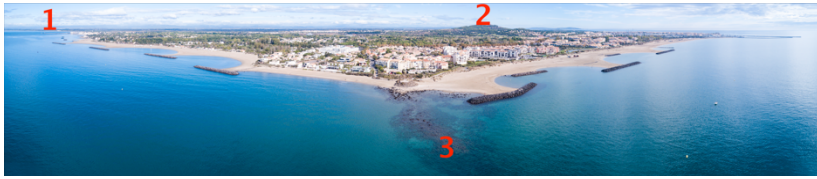
Figure 3. Panoramic view of Cap d'Agde, looking north: (1) Hérault River mouth; (2) Saint-Loup Hill; and (3) Rochelongue reef.

As mentioned, interpretation of Rochelongue still in discussion 52 , the idea of a shipwreck it is hard to prove because the absence of any wooden hull remains (even any trace of such), rope, rigging elements or other equipment typically associated with water craft that would provide definitive evidence of a boat or ship. The complete assemblage amounts to a total weight of approximately 1.3 tons, a rather low tonnage in comparison to that of known Mediterranean wrecks of the seventh and sixth centuries B.C., which range from 2–4 tons up to 30 tons. If indeed the site is that of a shipwreck, then the vessel type we most likely are dealing with is a small riverine boat with limited coastal capability, rather than a true sea-going ship. On the other hand the interpretation of the Rochelongue material as a votive offering has been argued mainly by Jean Gascó 53 , who has explained in depth the supplicatory nature of the deposit. This interpretation is in line with other sites that shows evidences of metallic artefacts submerged in the coastal or riverine environment and interpreted as votive. This is the case for sites dated in Bronze Age as the ones found at Great Britain (Samson 2006) or Spain (Priego 1995).