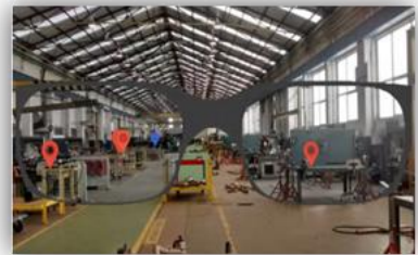
Figura 4. Navantia's identified Key Enabling Technologies and applications in shipbuilding industry.

Among its strategic actions, Navantia has established a partnership with the University of A Coruña called "Unidad Mixta de Investigación" (UMI), and with the University of Cadiz, with which it has established a collaboration framework through the Joint Innovation Unit Navantia-University of Cadiz (Unidad de Innovación Conjunta, UIC), which includes seven lines of research and technological development.