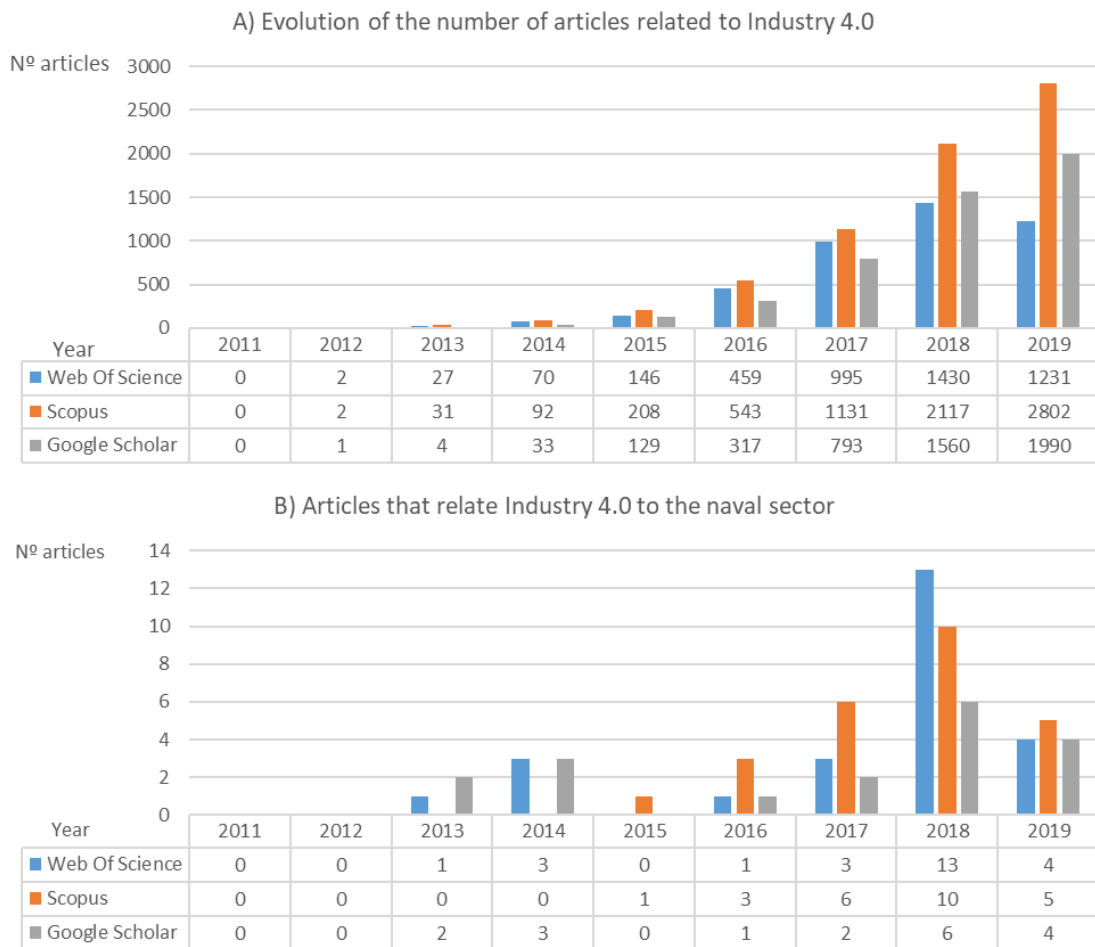
Figure 2. A) Evolution of the number of articles related to Industry 4.0 (top). B) Articles that relate Industry 4.0 to the naval sector (bottom).

This analysis reveals, on the one hand, the growing interest that the Industry 4.0 per se has aroused and, on the other hand, the evident contrast with the reduced number of specific publications in the naval sector. Thus, it reveals the need to make an effort by the academy and the naval industry together, focused on the development of the disruptive technologies of the Industry 4.0, with the objective of increasing the added value of the manufactured products and looking for the sustainability of a highly competitive global sector.