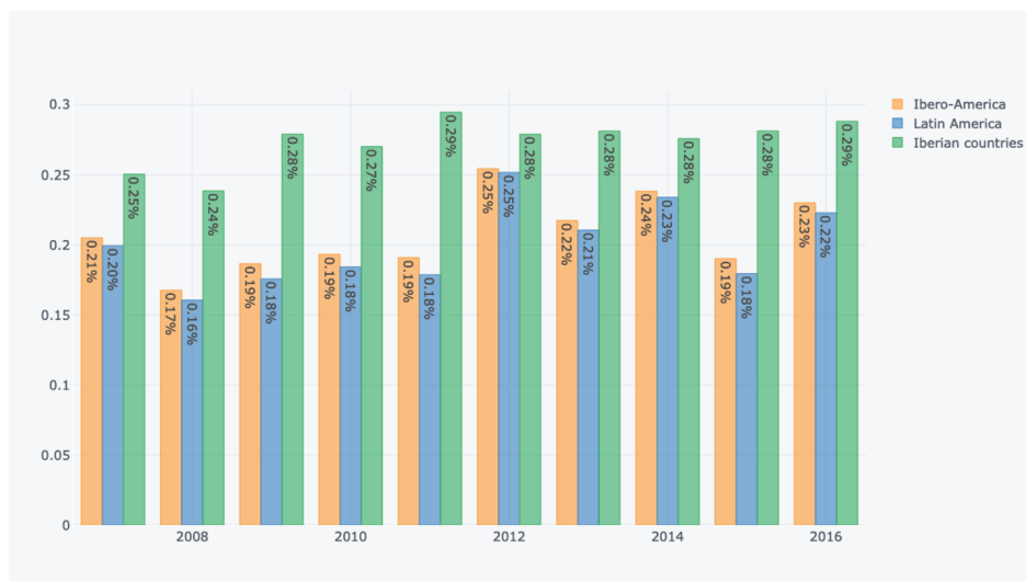
Figure 3. Average women inventor ratio ( women/men ) over time, per region in patent applications with priority years (2007–2016) for which the applicant was resident in an iberoamerican country.

However, the average women inventorship ratio in Cuba overtakes 40%, despite its minor level of inventorship. Compared with other Iberoamerican countries like Costa Rica, Guatemala, Nicaragua, and Paraguay, there is a greater distance. A closer look at the Cuban patenting environment can help to understand this phenomenon.