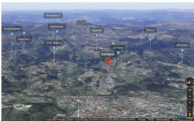
Figure 2 Satellite 3D image of the 9 different sampling locations in relation to the CHTMAD hospital centre in Vila Real, Portugal.

collected from different points of each corresponding drinking trough and cowshed, respectively. Swabs were collected into Stuart transport media; water was recovered into 500 mL PET flasks with 60 mg/L sodium thiosulphate and soil was gathered into appropriate zipper seal sample bags. Samples were processed in the same day or stored at 4°C for a maximum of 24 h. Swabs and soil samples were incubated into Brain Heart Infusion broth with 6.5% (w/v) NaCl for 48 h at 37°C and after seeded on Oxacillin Resistance Screening Agar Base (ORSAB) supplemented with 2 mg/L oxacillin. Water samples were filtered through 47 mm 0.2 µm filters that were further placed on ORSAB plates with 2 mg/L oxacillin. All plates were incubated for 24 to 48 h at 37°C and after screened for presumptive