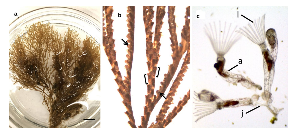
Fig. 1 (a) Whole colony of a preserved B. neritina . Scale bar represents 10 mm. (b) Light micrograph of a preserved fecund B. neritina colony, with feeding zooids (in square brackets) arranged bi-serially and ovicells (arrowed). (c) One live ancestrula (a), the first feeding zooid developed from a larva, and a juvenile B. neritina colony (j) with two fully developed autozooids with extended lophophores (l), at the base of which are the mouths of each feeding zooid.