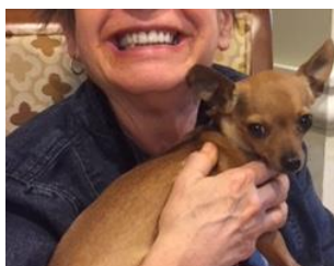
Figure 3. A dementia patient happily hugging a chihuahua.