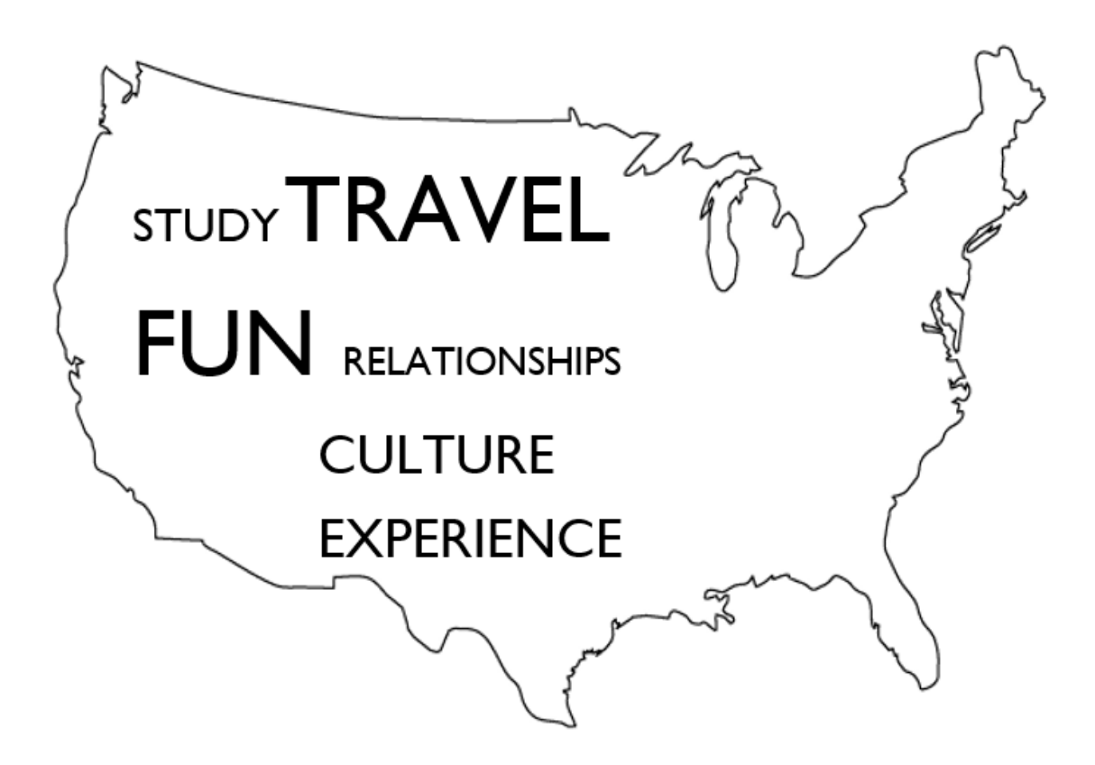
Figure 2. A concept map drawn by an international study participant. The map is presented in cartoon form to protect the anonymity of the student.

After participants identified each item on the mind map, we asked them about their experiences using the question set (Table 1). The questions ask interviewees to reflect on the key elements of our framework (Figure 1). We found that after placing the abstract ideas on the maps, participants were able to return to them repeatedly as conceptual centers for their narratives as we stepped them through the question set.