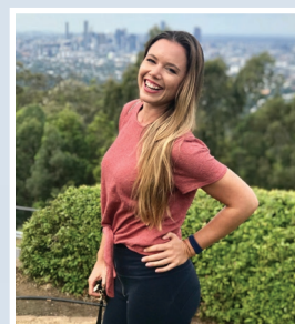
Learning Down Under