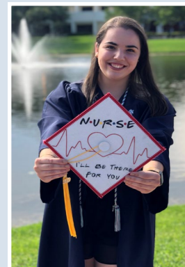
Funding Our Potential