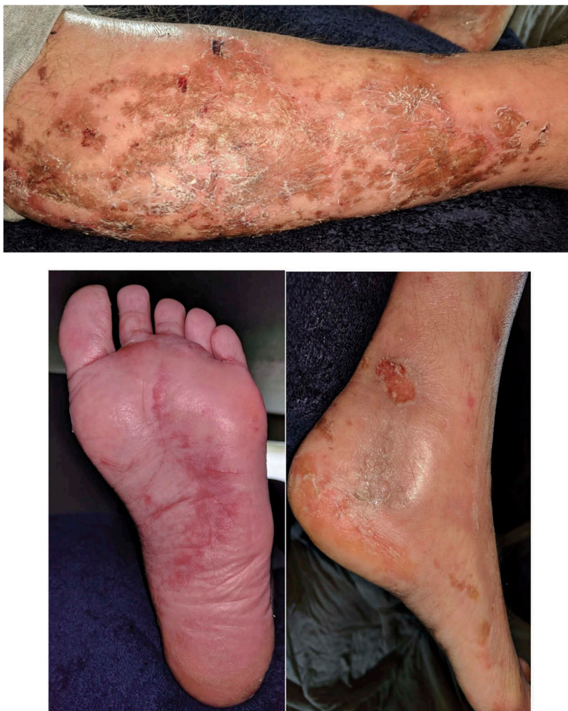
Figure 1. Affected area of the skin showed desquamation, erythema, and ulceration in lower extremities and sole.

showed a large, heterogeneously enhancing mid to distal pancreatic mass measuring 9.4 \times 3.8 cm with surrounding low-attenuation soft tissue thickening (Figure 2). Tumor marker, CA 19-9 was 2.0 (reference range < 35 U/ml); however, glucagon was elevated to 2,178 (normal < 80 pg/dl). Prolactin, T4, and TSH levels were within normal range. Hemoglobin and hematocrit were low at 12.2 (reference range 13.5–16.5 gm/dl) and 36.1 (reference range 40–50%), respectively. Liver enzymes were within normal limit. There was no leukocytosis or fever, indicating cellulitis less likely.