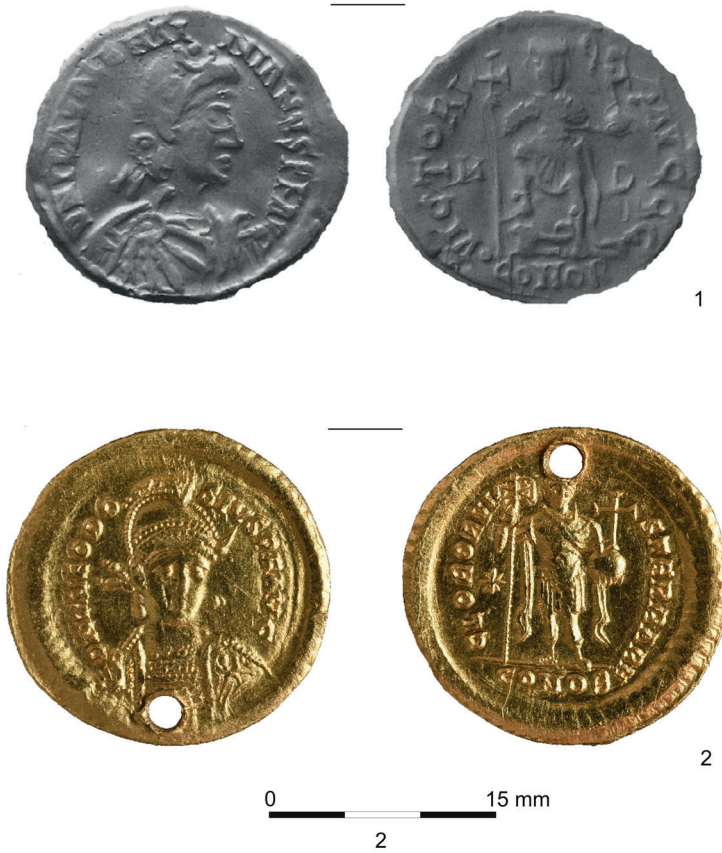
Fig. 1. Roman solidi in the Upper San River basin: