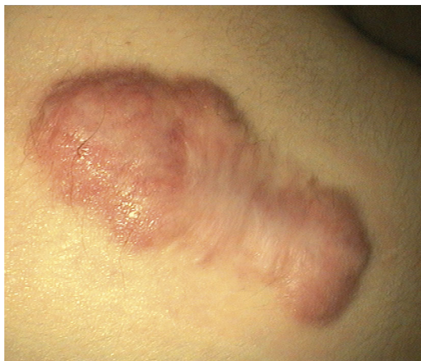
Fig. 1. Keloid (own material)