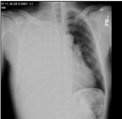
Image5. Massive right pleural effusion with shift of mediastinum towards left

• Lung entrapment with malignant effusions is most common with mesothelioma or primary lung cancer.