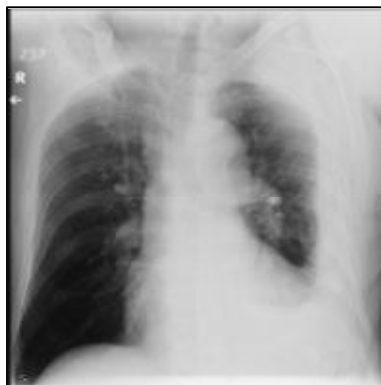
Image 3. Left lateral decubitus film showing freely layering pleural effusion