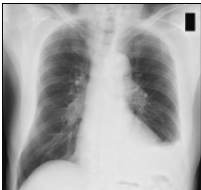
Image 2. Chest radiograph showing left-sided pleural effusion