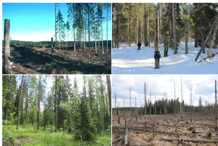
Fig. 2 Examples of practical retention and restoration. Top-left: retention tree group and high stumps in a clear-cut, first post-harvest summer (MONTA experiment, Finland, June 1996). Top-right: gap felling combined with high stumps, third post-harvest winter (Future Forest experiment, Sweden, March 2013). Bottom-left: selectively-felled mixed uneven-aged forest, third post-harvest summer (DISTDYN experiment, Finland, June 2012). Bottom-right: combined prescribed burning and intentionally killed, pushed-down trees at and around a paludified patch, seventh post-harvest summer (EVO experiment, Finland, May 2009).