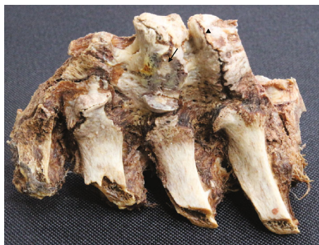
FIGURE 3: Section of disarticulated spine showing seam within osteophyte spanning T6-T7 IVD (arrowhead) and IVD tissue (arrow) contained within osteophyte spanning T7-T8 IVD.

cause visceral pain due to compression injuries of the sympathetic trunk [12].