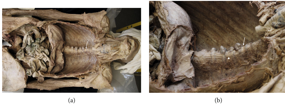
FIGURE 1: Thoracic osteophytes spanning vertebral bodies of T6 to T11. Arrows indicate T6 vertebral body, and the arrowhead the anterior longitudinal ligament. (a) Superior in situ view. (b) Left superolateral, close-up view.