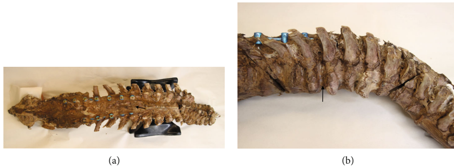
FIGURE 2: Disarticulated spine showing posterior fusion hardware and osteophytes. Arrows indicate T9 vertebral body. (a) Posterior view of entire spine. (b) Right, lateral, close-up view showing relationship of fusion hardware and osteophytes.

the midline, its deep surface was noted to be in contact with osteophytes at T6-T7 and T8-T9. No compression of the sympathetic trunk by the osteophytes was found. At the conclusion of the anatomy lab course, the spine was disarticulated from the cadaver at the sacroiliac and atlantoaxial joint; at which time, hardware from an extensive thoracolumbar posterior fusion was noted. In order to expose the spine and hardware completely, residual soft tissue was removed by sharp dissection and successive immersion and rinsing using a bleach solution. This exposed the pedicle screws and rods spanning from T9 to L3 bilaterally, overlapping the thoracic osteophytes by two segments (Figure 2). A seam over the middle of the intervening IVD, a hallmark of SD, [8] showed clearly where the bony contributions from the involved vertebral bodies intersected (Figure 3). A wedge cut into one of the osteophytes was then made and IVD tissue was noted within the bone tissue surrounding the osteophyte (Figure 3).