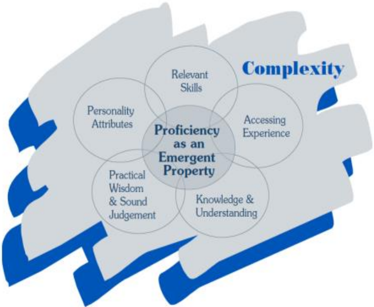
Figure 5. Leadership is a systemic property and proficiency that emerges from the interaction of elements in a complex context

Pourdehnad and Starr (2014) 81 suggested five interdependent (multiplicative) elements that enable leadership proficiency in a complex context. Any element alone is necessary but insufficient; it is the interactions among all from which leadership emerges and which contribute to improved organization performance which includes meeting the desired purposes and interests of stakeholders. These leadership elements are personality attributes, relevant skills, accessing experience, knowledge and understanding, and practical wisdom and sound judgment (see Figure 5 and Table 7).