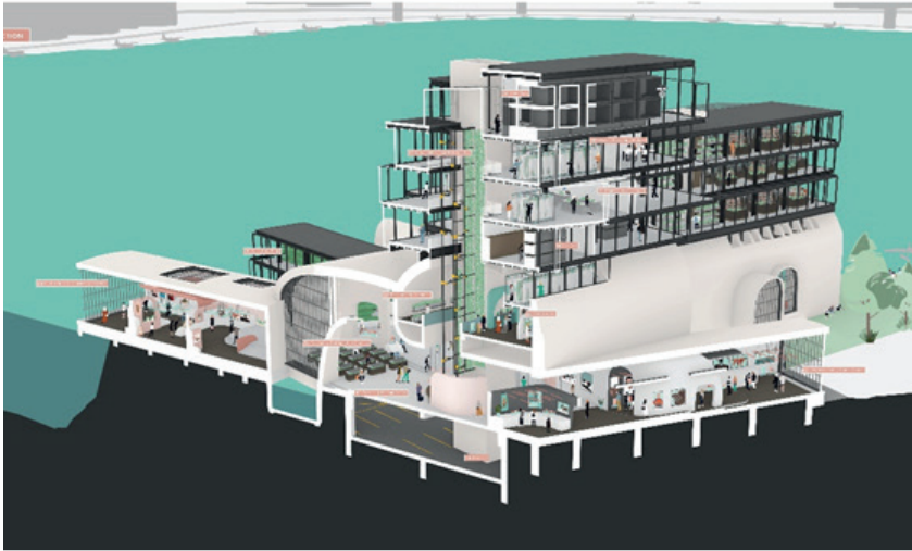
Figure 3. Building Corner Section - Food Museum and Cultivation Facility