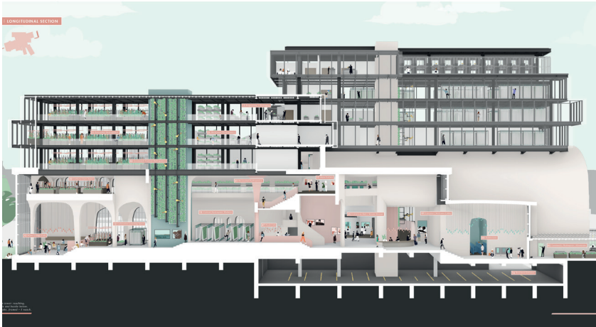
Figure 3. Building Corner Section - Food Museum and Cultivation Facility © Tiago Vasconcelos, 2019

matic spheres in Anchorage and Alaska today, and is too, inspired by explorative fieldtrip spent by the author in Anchorage, Alaska.