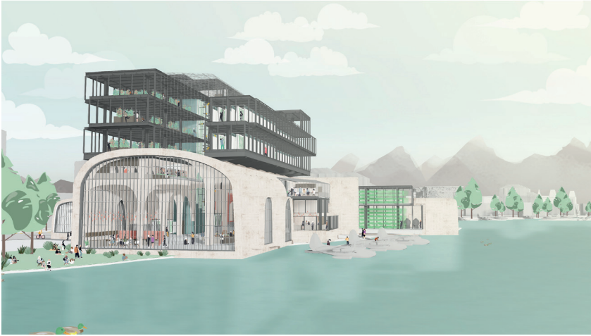
Figure 2. Building Perspective - Food Museum and Cultivation Facility

der to face current urban-societal challenges we need the cultivation of multi-sectoral approaches by connecting dots, coupling ideas, and creating solutions to potential impacts by responding to seemingly unrelated issues simultaneously.