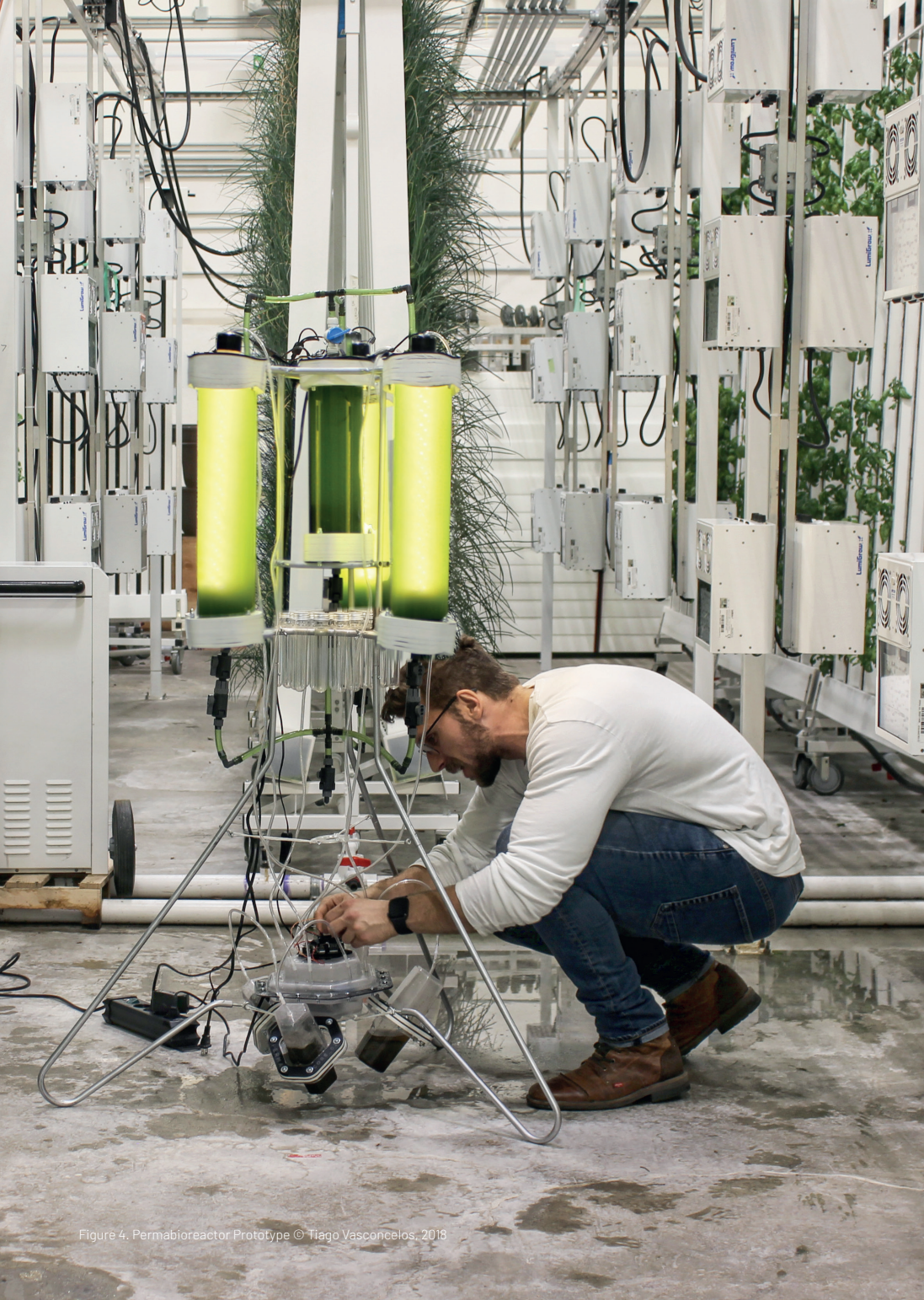
Figure 4. Permabioreactor Prototype © Tiago Vasconcelos, 2018