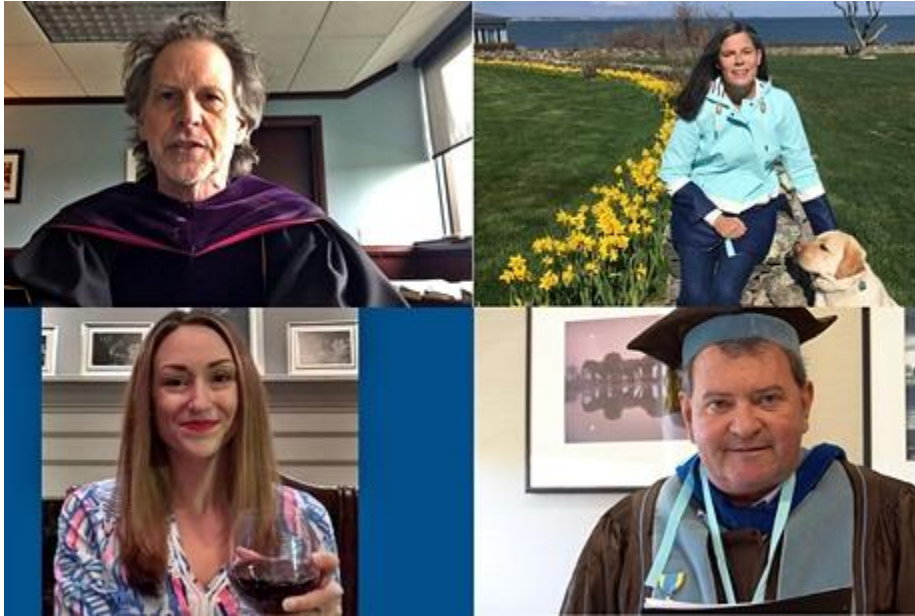
"Virtual Commencement" 2020 at RWU Law

A cool, cloudy morning gave way to a sunny afternoon in Bristol Friday as a “virtual Commencement” observance was held to honor the 147 graduates of Roger Williams University School of Law’s Class of 2020 , pending an in-person event to be held when the COVID-19 pandemic has passed.