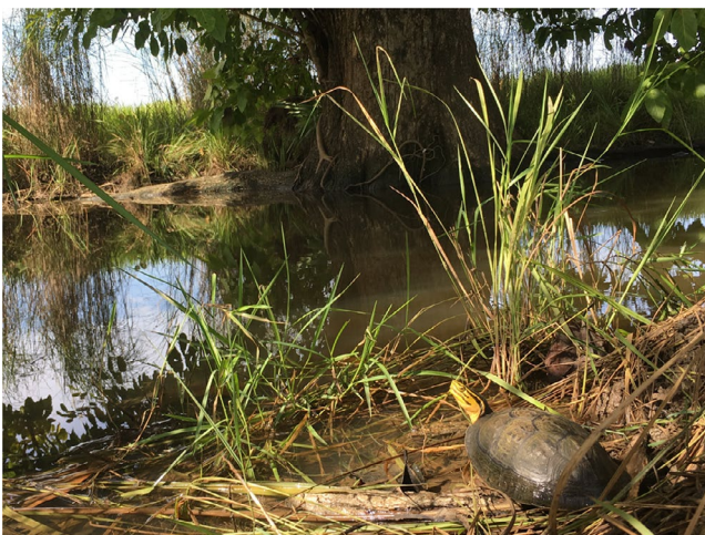
FIGURE 1 Adult Southeast Asian box turtle ( Cuora amboinensis ) near an ephemeral wetland in savanna, Rawa Aopa Watumohai National Park, South East Sulawesi, Indonesia. Photograph was taken by N. Karraker on 25 April 2018

In addition to their roles as predators and scavengers in aquatic and terrestrial habitats and moving nutrients between ecosystems, C. amboinensis are likely prey for birds and mammals in our study area. Although we did not document instances of predation, C. amboinensis , and particularly eggs and hatchlings, have been documented as prey of crocodiles, monitor lizards, wetland birds, and mid-sized mammals, such as civets (Moll & Moll, 2004; Stanner, 2010). Given that this turtle has a hinged plastron, or lower shell, and can