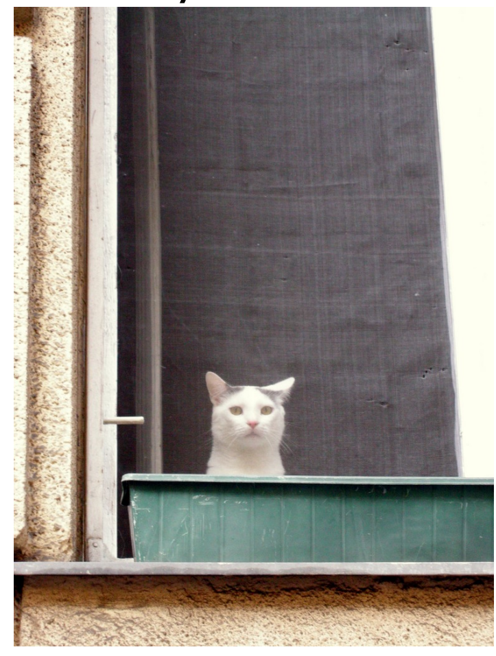
Curious cat