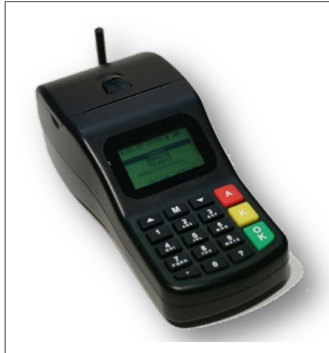
Figure 2. The Portable Electronic Cash Register

This IO relationship was selected conveniently because it was the only project of portable IT implementation in IO transactions during the period of the study. It was one of the many projects across African countries sponsored by the World Bank to enable governments to achieve better tax administration within their jurisdictions. Portable IT deployment and use among governments, businesses, and individuals in Africa have experienced phenomenal growth since the beginning of this century. One of the reasons for this is that portable ITs take advantage of wireless networks to overcome infrastructure deficiencies. These realities appear to have informed the deployment of portable IT for tax administration. They provided the opportunity to gather relevant data about how the technology is implicated in IO control.