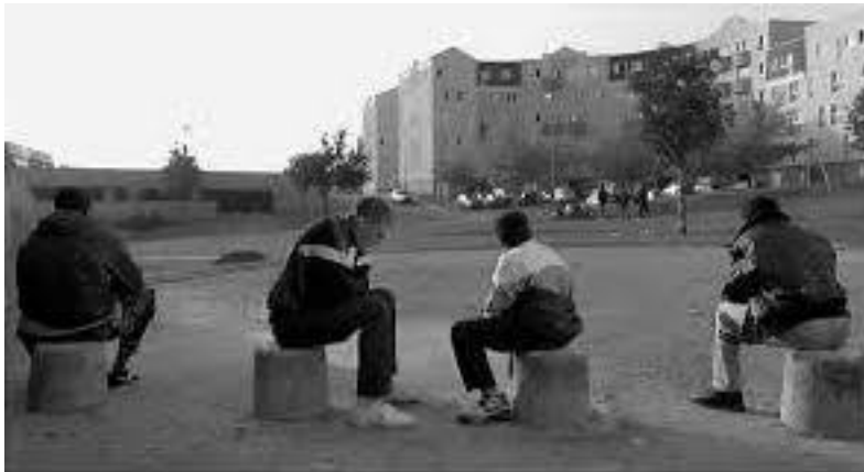
The trio and a friend in the banlieue 113

them and keep them in a marginalized position. In Paris, they feel out of place, because they do not belong, which exemplifies their feelings of alienation and separation from the rest of society. The close-up shots emphasize their lack of mobility outside of the banlieue and how they are not welcome in certain spaces and are confined to the banlieue most of the time by society's gender and racial norms.