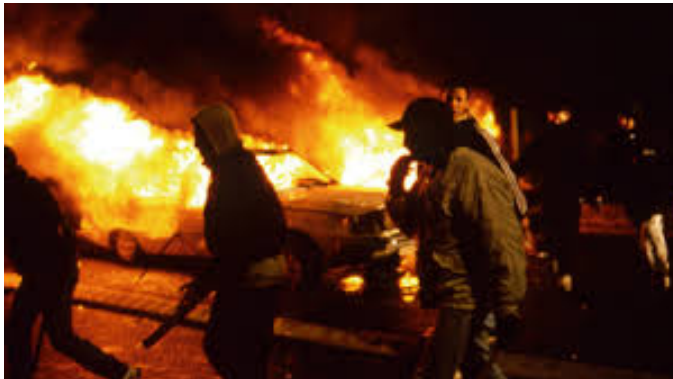
The destruction of cars in Ma 6-T Va Crack-er 152

perspective and perception of the banlieue to that of the male or masculine experience, the absence of female characters is noticeable and contributes to the trajectory and themes of the film. Higbee adds that, “The inclusion of female characters invested with authority derived from the state such as the head teacher, or the plain clothes police woman (who takes an active role during the aggressive identity check and search of the young males from the cité ) is, therefore, highly significant.” 151 The addition of female characters with authority in the film is in direct contradiction with the male domination and perspective in the banlieue, so these women are shown very briefly, and their impact on the rest of the film is minimal. However, what is significant is that they appear at all and in positions of power and authority.