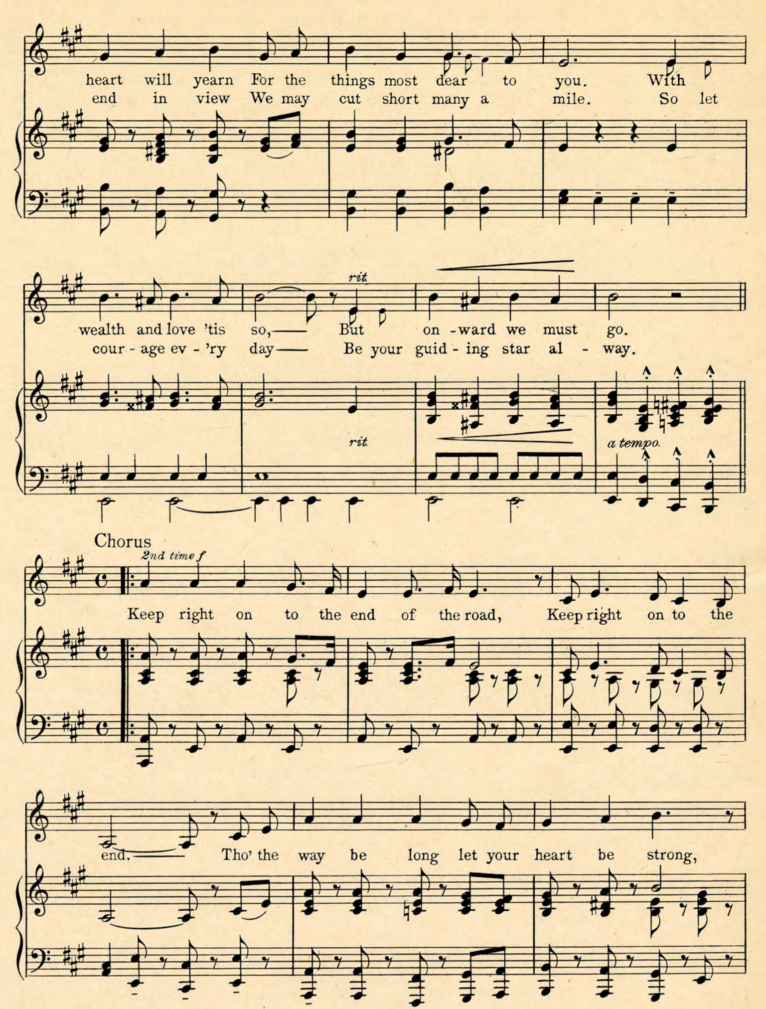
7833-3 The End Of The Road