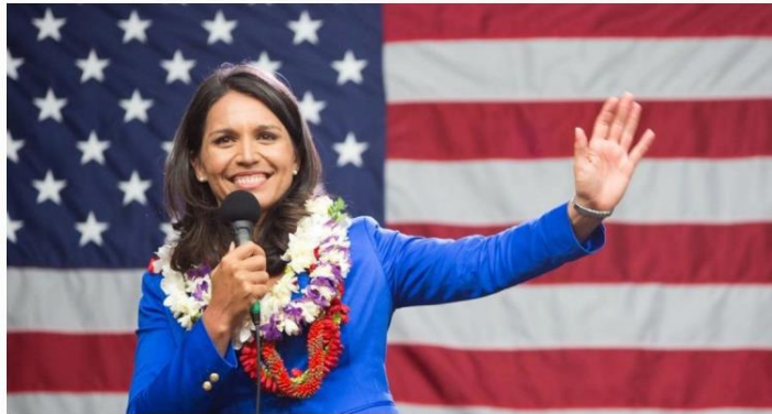
Figure 3: Swarajya.com highlighting media criticism from famous individuals

In a similar vein, OpIndia published a rebuttal by a former Indian army officer to an article written by an op-ed writer, Sagarika Ghose, in which she characterized war as a “naked display of government power” that is glorified by spectacle-driven television. In the OpIndia piece, the former army officer wrote: