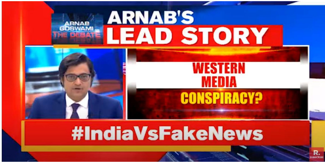
Figure 6: A screenshot from Republic TV's debate on 'fake news.'

For example, when the Supreme Court of India dismissed petitions from Congress Party that sought a review of the government's purchase of Rafale fighter jets from France, Republic TV attacked the established media for spreading 'fake news' against the Modi government. The court's observations that no irregularities or corruption were found in the purchase of the fighter jets served as evidence for Republic TV to accuse the mainstream press of providing a platform to distribute a distorted version of the 'truth.' In his commentary, Arnab Goswami characterized this coverage not as a routine journalistic practice where news media cover accusations made by the opposition party, but as an effort to promote a 'deliberate lie' aimed at advancing a "left-liberal narrative." According to Goswami, the Supreme court verdict exposed "fake news" spread by mainstream journalists, who, in his view, contributed enormously to the spread of "fabricated stories" and "lies" on the defense deal. His efforts to characterize the media