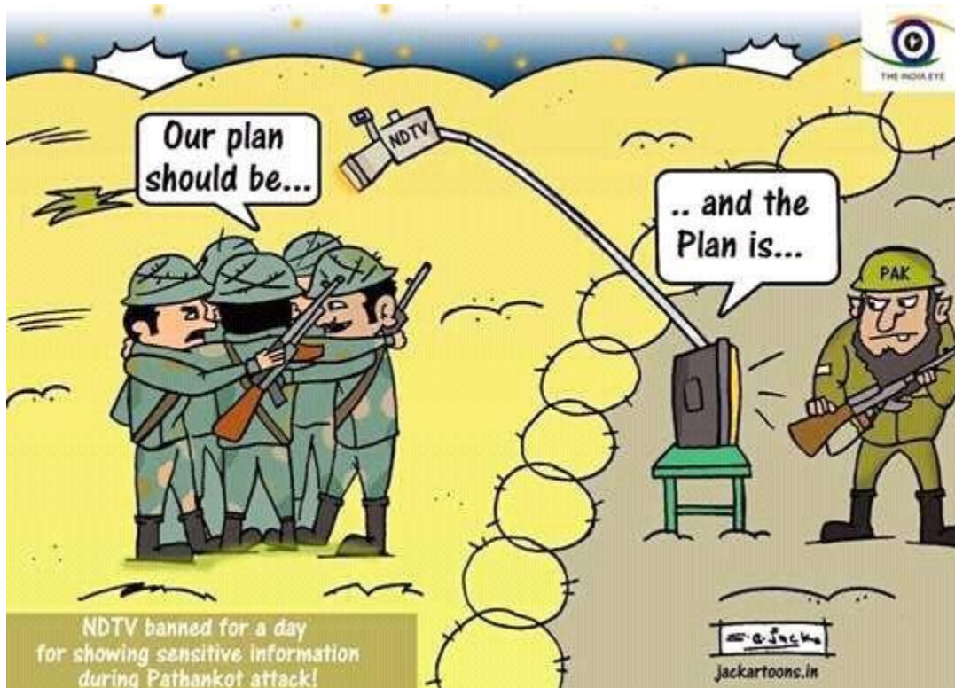
Figure 10: A cartoon shared by online Hindu nationalists on social media, which accuses NDTV of aiding the enemy through its 'irresponsible' coverage.

Additionally, the coverage of terrorist attacks and hostage situations by 24-hour news channels have come under sharp criticism from the online right-wing supporters. According to them, the live coverage including details of security deployment, availability of ammunition, presence of civilians as well as government's action plan--all help terrorists successfully carry out the operations.