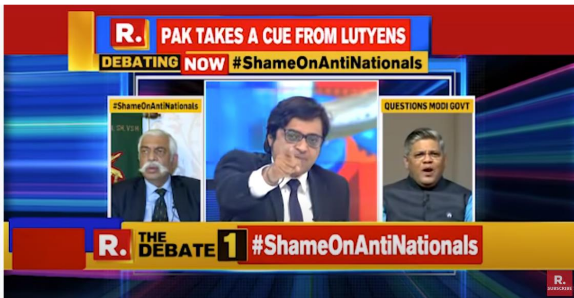
Figure 5: A screenshot from Arnab Goswami's 'The Debate'

Please, BBC , open your mouth. Which reporter and camera person shot that video? What was the source of the data? Don't run away from me now, BBC . The figures you bandied about, what was the proof gathered from? What is your source? If it was fake news, a lie, a dirty or a motivated lie by a dying government-owned British channel, then I want to know, and India wants to know, what is your intention? Now, the BBC seems to be simply caught red handed. Someone should report it to Boris Johnson, who should lock up the entire management of the BBC in jail for shaming them yet again. The best thing for the BBC would be to acknowledge its lie, apologize and move on hoping that Indians forgive them. But tonight, we in the Indian media, at least some of us in the Indian media, enjoy catching these journalistic relics in the act of lying and fabricating facts...never has there been a more pleasurable moment for all of us than catching these falsifiers who preached so much in the very act of fabrication. And our campaign has just begun. Watch out BBC now... watch out. BBC , we are coming after you. We will make you squeal (“Western media peddles,” 2019).