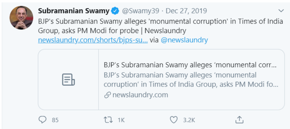
Figure 9: BJP leader, Subramanian Swamy’s tweet alleging money laundering and tax evasion by the Times of India group

To further the accusation that the established media are corrupt, online Hindu nationalists also claim to cite a 2010 report from the Press Council of India, which gave a detailed account of the prevalence of paid news in the press during the 2009 elections in different states.