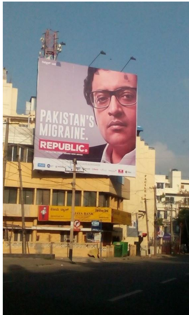
Figure 1: A billboard advertisement for Republic TV