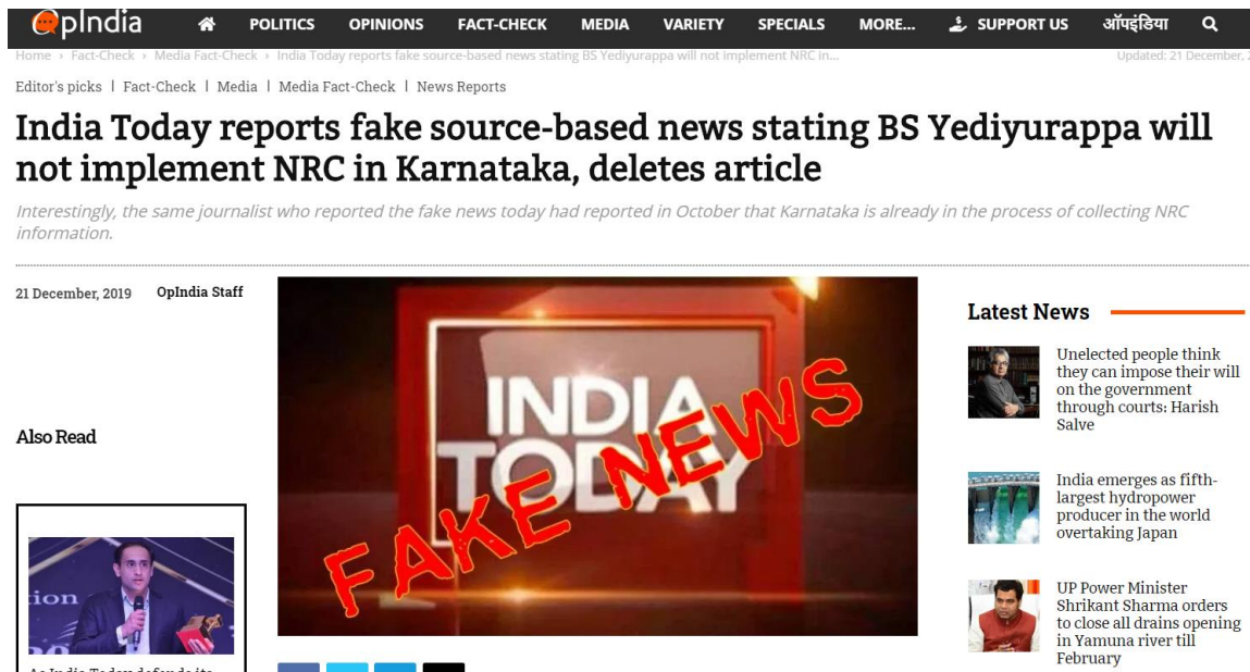
Figure 2: A snippet from OpIndia article criticizing the mainstream media

targeted for being Kashmiri. Gangwad police station made it clear that both sides are Muslims in this case, so there is no question of it being communal. The police categorically denied the report of The Wire , in which Bihari students have called Kashmiri students as terrorists (“Leftist Portals and Politicians,” 2019).