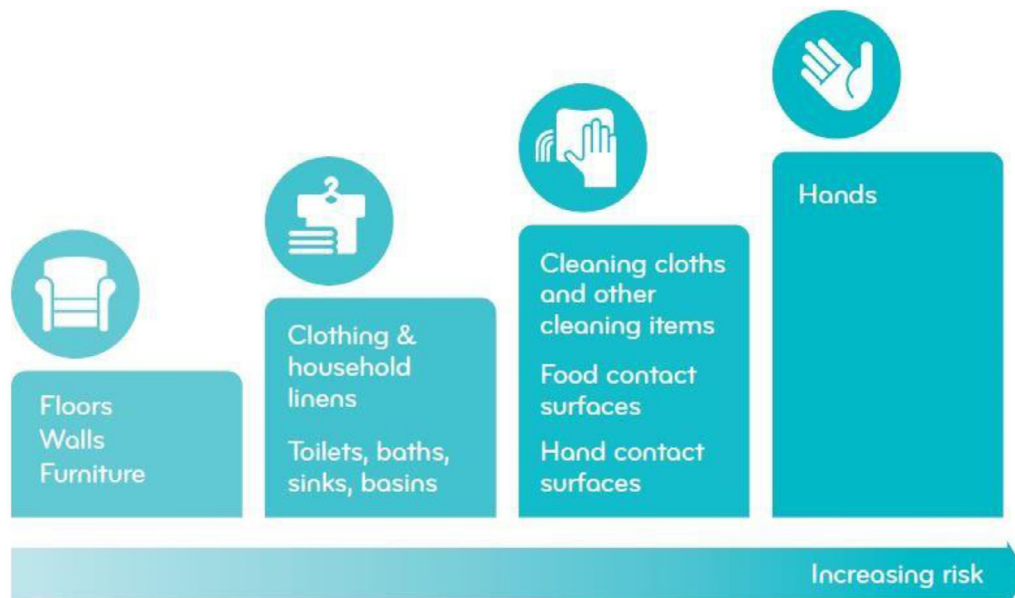
Fig 2. Critical surfaces in the home, ranked by risk of infection transmission (adapted with permission from the IFH, see ref. 15)

most likely to be spread, in order to break the chain of infection transmission. The key risk moments within home and everyday settings include food handling, using the toilet and changing a baby's diaper/nappy, touching surfaces frequently touched by others, coughing, sneezing and nose blowing, handling and laundering clothing and household linen, caring for domestic animals, disposing of refuse, and caring for an infected family member who is shedding infectious microbes into the environment. 15,16,83,84