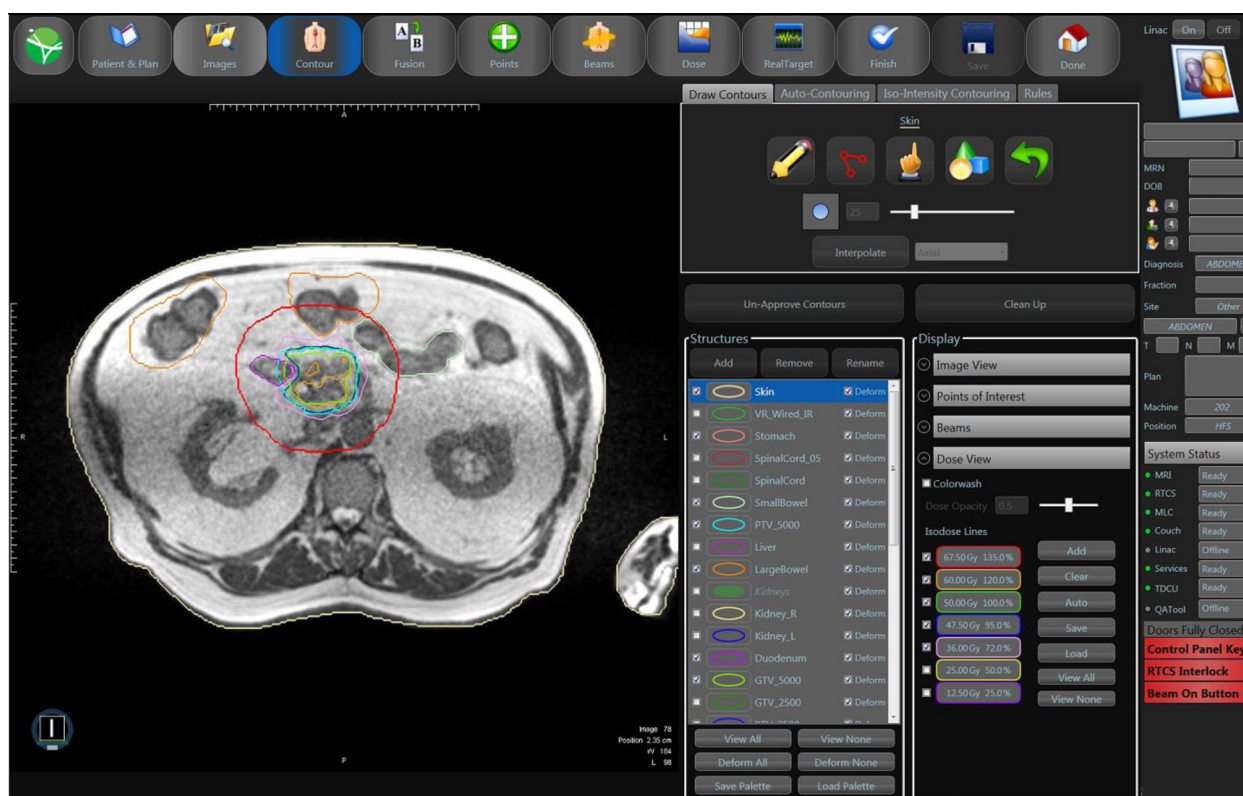
Figure 2 Example of remote coverage screen.

investigation. Excessive background noises on the call could cause slight distractions or interruptions in our process and were addressed with further communication as needed.