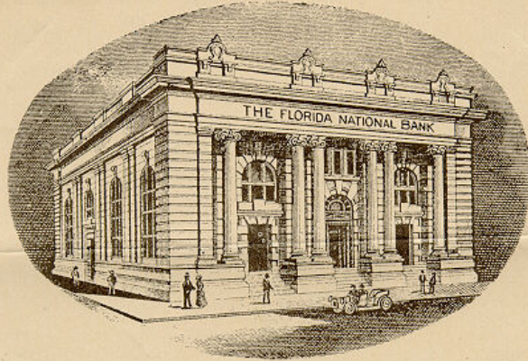
ACCEPTED DESIGN OF THE FLORIDA NATIONAL BANK