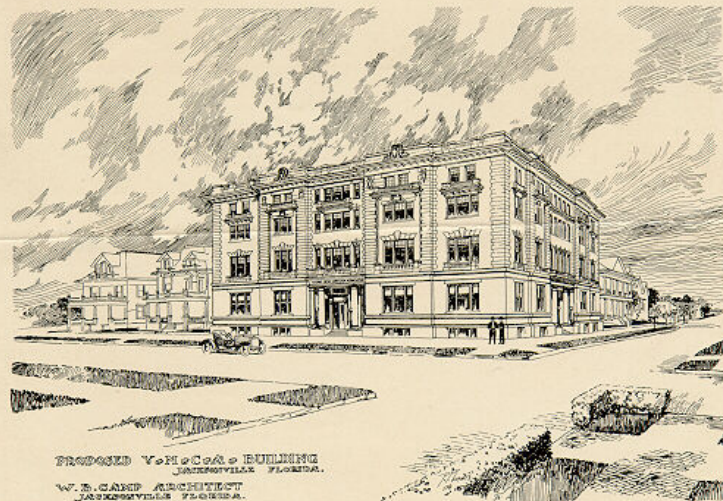
PROPOSED Y. M. C. A. BUILDING JACKSONVILLE, FLORIDA. W. B. CAMP, ARCHITECT JACKSONVILLE, FLORIDA.

PROPOSED Y. M. C. A. BUILDING For Jacksonville, Florida W. B. CAMP, Architect