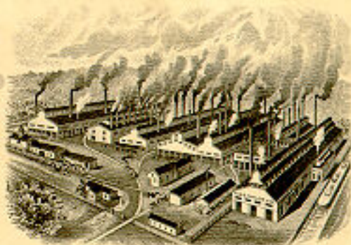
OPEN HEARTH FURNACES, ROLLING MILLS AND BLACKPLATE PLANT, CUMBERLAND, MD.

GENERAL OFFICES, MARINER AND MERCHANT BUILDING, CHESTNUT AND THIRD STREETS, PHILADELPHIA.