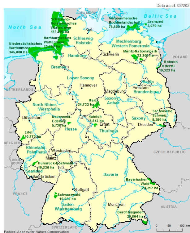
Figure 1. German national parks (Source: Bundesamt für Naturschutz (BfN), 2019, according to the basic geodata of the federal states: © GeoBasis-DE/BKG 2018 https://www.bfn.de/en/activities/protected-areas/national-parks.html , accessed 30 June 2020).

The first German national park (Bavarian Forest) was established late, in 1970. In 2005, when the evaluation process was started, 14 national parks existed in Germany. In 2014 (Black Forest) and 2015 (Hunsrück-Hochwald), two more national parks were established and the discussion on the foundation of further national parks is still ongoing [15,16]. Figure 1 provides an overview of the parks' geographic distribution. They include different landscape and ecosystem types: the Wadden Sea and coastal areas, lake areas and river floodplains, high mountain ranges in the alps and different types of forests, e.g., beech forests which are partly designated as UNESCO World Natural Heritage (Figure 2). The 16 national parks cover a total area of 1,047,859 ha, including marine areas; and 205,655 ha excluding marine areas. Their size differs substantially, ranging from 3070 ha (Jasmund) to 441,500 ha (Wadden Sea Schleswig-Holstein). The size of the national parks without marine areas is between 5738 ha (Kellerwald-Edersee) and 32,200 ha (Müritz). All but three of the parks reach the minimum size of 10,000 ha, as suggested by the quality set for German national parks [11,12]. For further information, see https://www.bfn.de/themen/gebietsschutz-grossschutzgebiete/nationalparke.html .