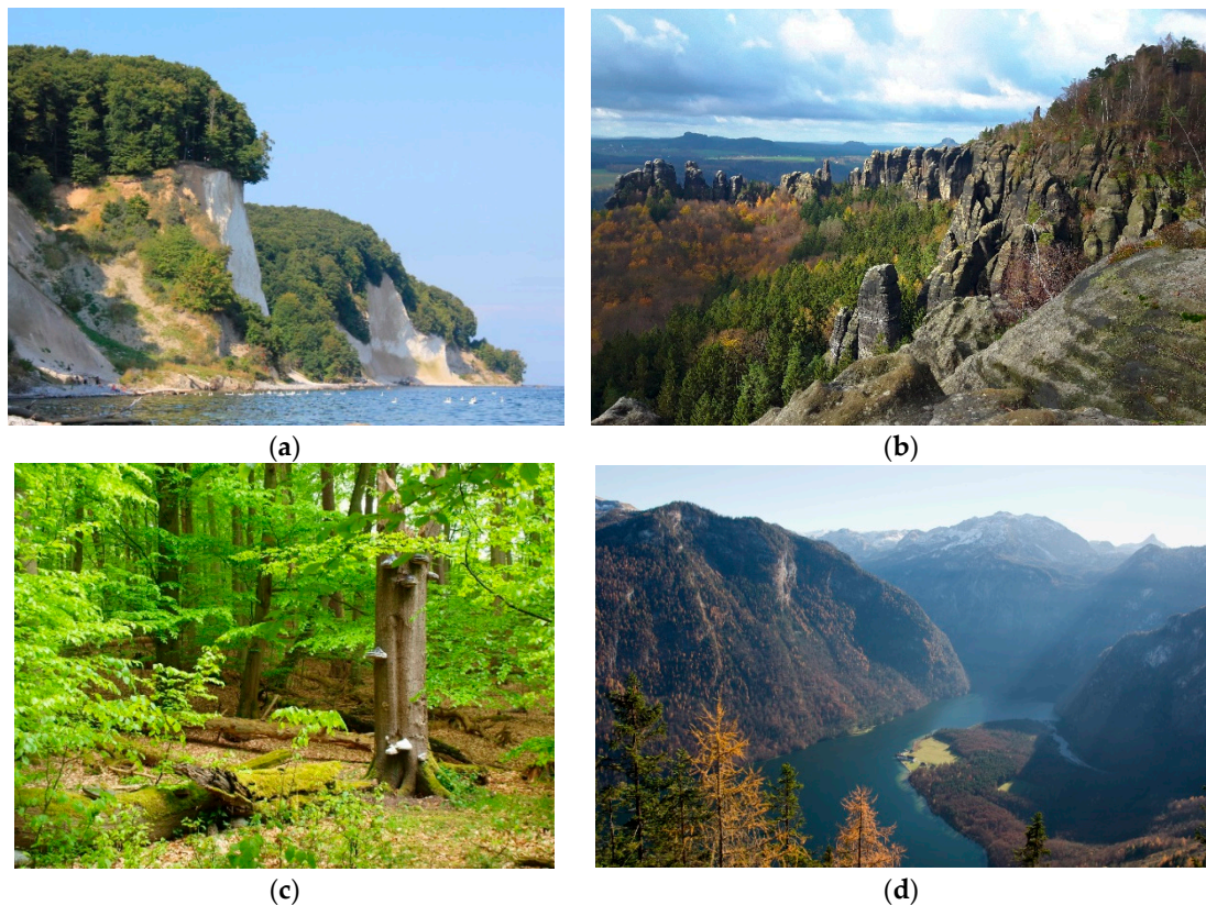
Figure 2. Impressions from German national parks: (a) Jasmund, chalk cliffs at the Isle of Rügen in the Baltic Sea; (b) Saxon Switzerland, sand stone erosion landscape; (c) Hainich, Thuringia, also designated as UNESCO World Natural Heritage site for its beech forests; (d) Berchtesgaden in the Bavarian Alps, view to Königssee in the management zone, a popular tourist destination. (Photos: a–c: Nationale Naturlandschaften e.V., K. Sabry, A. May, S. Schubert; d: M. Günther).

German national parks are managed in line with the IUCN’s requirements for protected areas’ management category II [17], although many of them do not yet meet all the requirements of this category. This concerns, in particular, the minimum proportion of 75% of the entire park, which must be dedicated to dynamic natural processes without human interference or land use (“nature dynamics zone”, often also named “core zone” or “nature zone”). Since Germany’s national parks are regarded as “development national parks” [18], they have to achieve this percentage only 30 years after their establishment. Moreover, this figure is not laid down in the German Federal Nature Conservation Act, which requires a nature dynamics zone proportion of at least 50% of the total park area, and the nature conservation laws of the individual federal states. However, the 75% target is explicitly mentioned in some national park acts and/or ordinances and also included in the evaluation quality set [11,12,14].