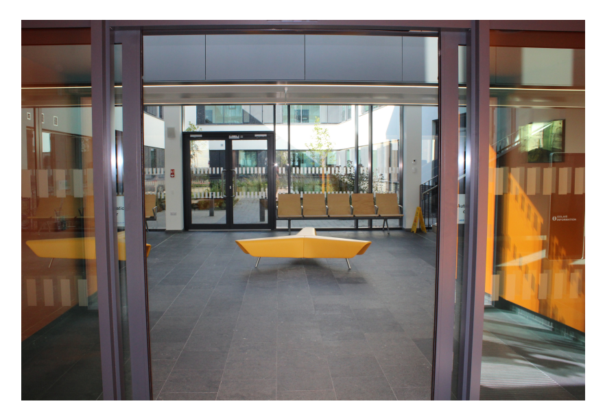
Figure 1: Entrance and main foyer of primary healthcare centre