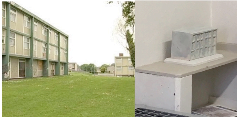
A student response to locality evoking a childhood memory of social housing, Togher, Cork

Slide 03: Student response to “A Little History of Cork” short course (by permission of Cork Prison)