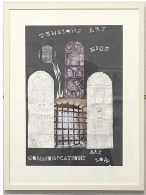
Slide 02: Student response to “Masterpieces of Irish Art” short course (by permission of Cork Prison)

Making thinking visible: student response to Harry Clarke The Eve of St. Agnes (1924) using windows as metaphors to express tensions between imagination (stained glass) and imprisonment (prison window and razor wire). This student reflects on building personal resilience by fostering effective communication strategies. The lesson is that communication diffuses tensions in prison. The student’s text reads: “Tensions are High; Communications are Low”.