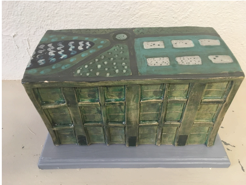
Slide 05: Student response to “Ten Great Works of Prison Literature” (by permission of Cork Prison)