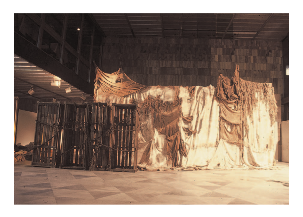
FIGURE 3. Romero, Sal-si-puedes. Installation view.