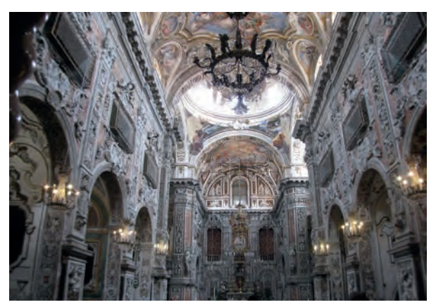
1. Church of Santa Caterina, Palermo.

too hastily elides baroque and Counter-Reformation. Certainly, this has been the dominant model within European scholarship on European baroque. But it is a perennial cliché, endlessly reiterated but rarely critically examined. In the great churches of Pallavicino in Bologna the cry of the Counter-Reformation resounds. But this is far from the situation in Naples or Sicily where the greatest adventures of the baroque take place (figs. 1-2). Baroque is far more than a first response to the spiritual crisis of the Reformation. Hostilities to Muslims, Moriscos and Jews arguably have as much purchase as anti-Protestantism.