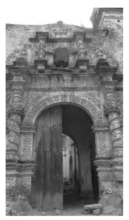
10. Façade of the church in Salinas de Yocalla (Bolivia), eighteenth century.

Recent debates within the writing of world art history have broken with references to the Brazilian reflection of Europe, the national paradigm; they seem to prefer an approach that follows a rather ethnically determined paradigm. Levy found a third way that could serve as stimulant or a meta-theoretical impulse for further developments of an art history of the baroque and the neobaroque.