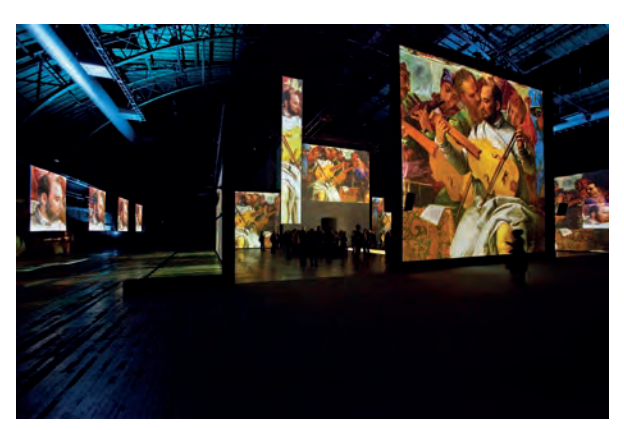
5. Peter Greenaway, installation view of Leonardo's Last Supper: A Vision by Peter Greenaway , exhibited December 3, 2010-January 6, 2011 at the Park Avenue Armory, New York.