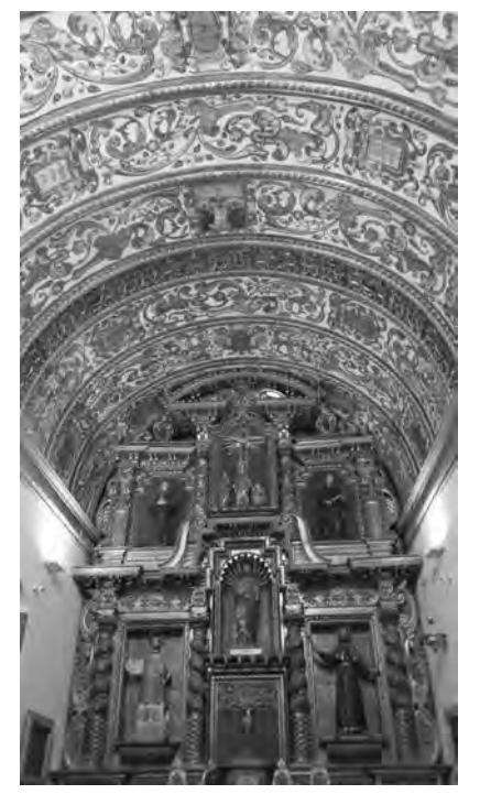
6. Capilla doméstica, Iglesia de la Compañía de Jesús, Córdoba, Argentina.

For example, new approaches like Eduardo Viveiros de Castro's notion of perspectival anthropology and controlled equivocation, or the post-comparative notion of "false friends," <sup>27</sup> can help in analyzing the complexity of the global baroque and in understanding how different visual systems and processes of conflict and negotiation were established in contexts of cultural alterity. This approach can facilitate the reevaluation not only of the relations between Christian colonizers and the indigenous communities, but also between the contemporary scholar and her objects of research, and offers alternative concepts to the dichotomy of center and periphery.