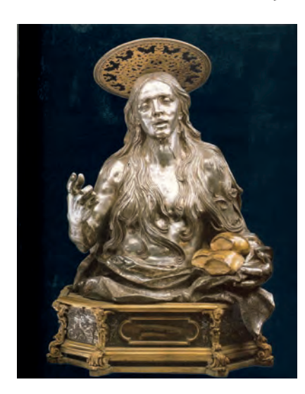
2. Lorenzo Vaccaro (attrib.), St. Mary of Egypt , silver reliquary, Naples, Chapel of the Treasury of San Gennaro.

How might the potential that baroque offers in relation to history – including history of art, music, literature – and conceptions of the past be best seized? In what ways might baroque decenter familiar narratives of the "long seventeenth century"? Part of baroque's greatest potential is in terms of historical time. History is too readily mobilized for political ends. Resisting periodization assists in thwarting simple historicism. Instead of subjecting time to chronology, Walter Benjamin's allegorical way of seeing grasps the constellation which one era has formed with an earlier one, opening a possibility of resistance to the catastrophe of modernity. Deleuze's theory of the baroque fold, in contrast, investigates the baroque as a creative