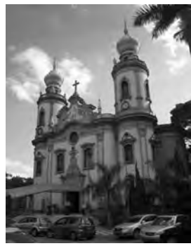
9. Church of Nossa Senhora do Brasil, São Paolo, façade and interior.

Jens Baumgarten. In my own research I analyze the architecture, decoration, and other visual material of the church Nossa Senhora do Brasil, one of the best known and most impressive churches in São Paulo, which can be classified as neo-baroque (fig. 9). The church combines different elements that reflect a political, religious and aesthetic project of Brazilian culture and history. It also shows the configurations