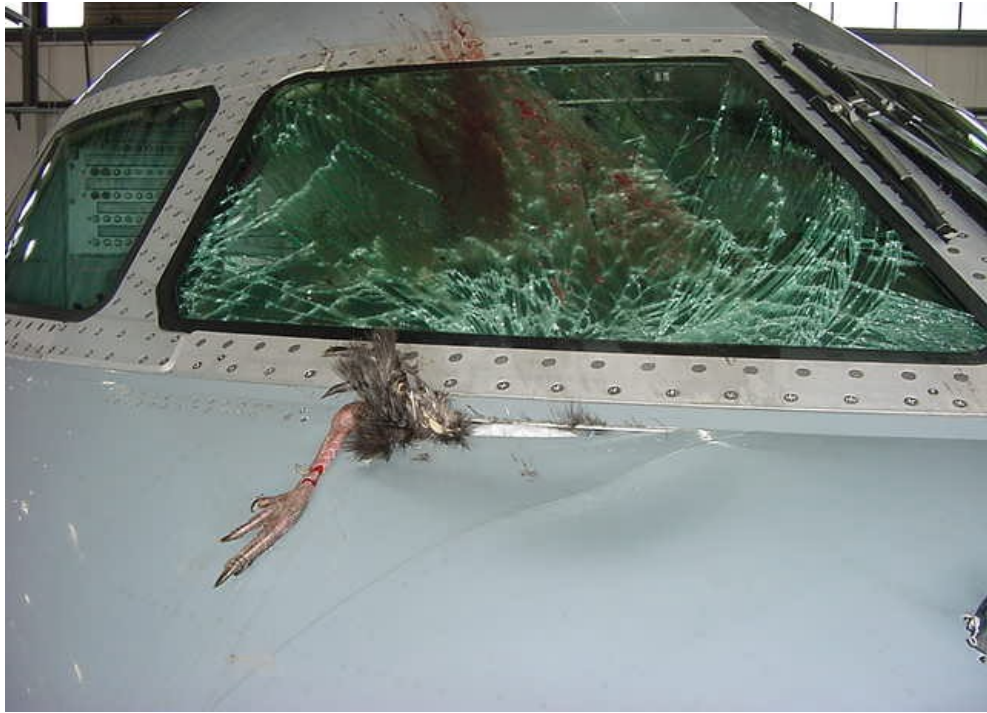
Figure 1. 2002 Turkey strike on commercial aircraft at Dulles International Airport.