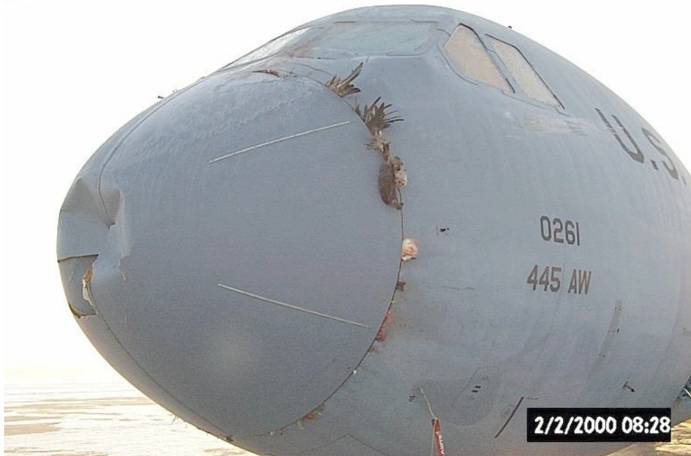
Figure 2. Canada Goose strike on radome of US Air Force C-141.