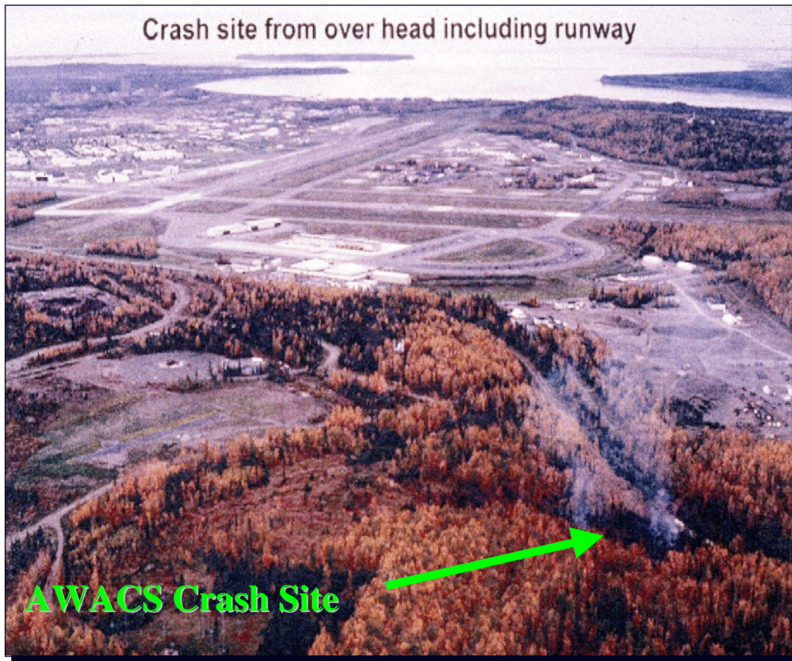
Figure 3. September 1995 AWACS crash from Canada Geese struck at Elmendorf Air Force Base, Alaska.

The US Navy and Marine Corps together report approximately 450 bird strikes annually costing an average of $21.7 million per year in direct costs, including six lost aircraft and two fatalities since 1994. Indirect costs to the US Department of Defense (DOD) are not calculated, but exceed the above values by substantial margins. Aviation industry analysts calculate the total direct and indirect costs to the civil aviation industry at over $1.2 billion US dollars annually. Insurance industry analysts place this figure much higher and conclude costs may approach $4.5 billion US dollars annually for US and Canadian civil aviation alone.