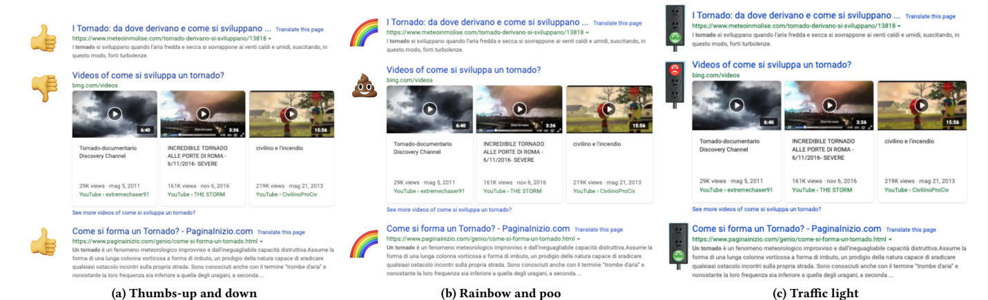
Figure 1: Three mock-up designs utilizing different emojis to enrich a SERP.