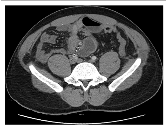
Figure 1. Calcification in the mesenteric root at CT scan.