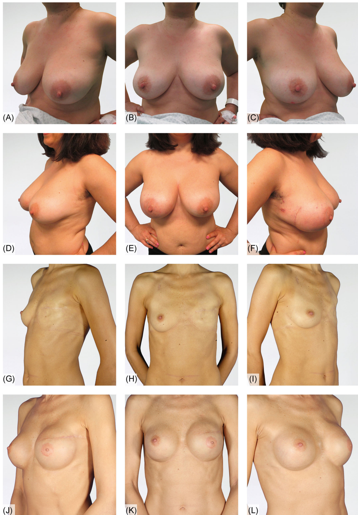
FIGURE 4 A-C, Preoperative lateral and frontal pictures of a right DCIS case; D-F, esthetic result after 6 months of right immediate prepectoral reconstruction; G-I, preoperative lateral and frontal pictures of a failure of previous left breast reconstruction; J-L, outcomes of left delayed prepectoral breast reconstruction, 24 months postoperative. DCIS, ductal carcinoma in situ [Color figure can be viewed at wileyonlinelibrary.com ]