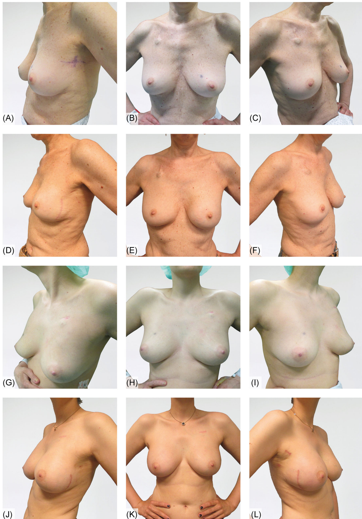
FIGURE 3 A-C, Preoperative lateral and frontal views; D-F, 12 months postop outcomes of left immediate prepectoral breast reconstruction; G-I, frontal and lateral views of right IDC case; J-L, 7 months from the bilateral prepectoral reconstruction after nipple-sparing mastectomies [Color figure can be viewed at wileyonlinelibrary.com ]