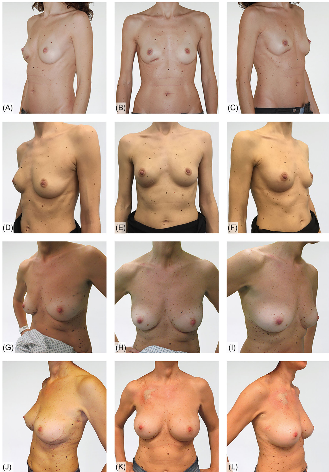
FIGURE 2 A-C, Preoperative pictures in lateral and frontal view, slight asymmetry of the right breast due to a previous clinical investigation; D-F outcomes at 21 months of unilateral right nipple-sparing mastectomy and prepectoral breast reconstruction with Braxon; G-I, preoperative lateral and frontal views of an IDC left case; J-L, outcome of left immediate prepectoral reconstruction after nipple-sparing mastectomy and right breast augmentation, 7 months postop. IDC, invasive ductal carcinoma [Color figure can be viewed at wileyonlinelibrary.com ]