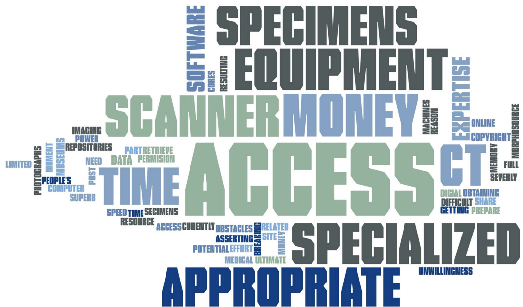
Fig. 2 Word cloud of 117 survey responses to the question ‘What do you see as the biggest obstacles to obtaining digital morphology data?’.

Although our respondents are likely from high-income countries, the majority (60%) were non-tenured (students, postdocs), and of those over half paid for generation of their digital morphology data 14 . While some institutes have equipment and policies for in-house imaging, others offer reduced collaborator rates in exchange for co-authorship. This practice has left a bad taste in the mouth of some scientists, who view such attribution as gratuitous and monopolistic of the digital data. At the same time, established researchers with exclusive access to specimens and equipment are not necessarily more likely to publish their datasets than those with fewer resources. The recently proposed best practices 11 for sharing 3D digital morphology data in support of published papers should improve this disparity, although data unassociated with peer-reviewed articles may languish indefinitely on hard drives and personal cloud stores due to issues of trust (scooping), resources, and (dis)incentives 12 .