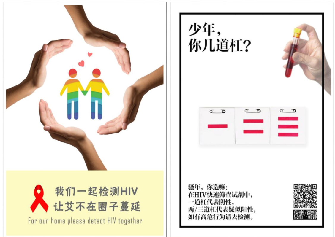
Fig 2. Two of the six crowdsourced HIV promotion images used in the intervention package. The six images were delivered biweekly during the 3-month intervention period via WeChat. Left text: “Let’s test for HIV together. Stop HIV from spreading in our community.” Right text: “Son, what’s your rank? HIV test: one line means negative; two or three lines means suspected positive. Please go and get HIV tested”.

https://doi.org/10.1371/journal.pmed.1002645.g002