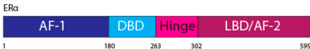
Figure 1. ER \alpha functional domains. The ER \alpha functional domains include; Activation Function 1 (AF-1) (purple), DNA Binding Domain (DBD) (blue), hinge (pink), Ligand Binding Domain (LBD) and AF-2 (plum).

Upon estrogen binding, ER forms homodimers (ER \alpha /ER \alpha or ER \beta /ER \beta ) and heterodimers (ER \alpha /ER \beta ) [8,9]. This review focuses on ESR1 encoding ER \alpha , referred to as ER henceforth. Following dimerisation, ER translocates to the nucleus and regulates transcription through estrogen response element (ERE) binding within target gene promoters (Figure 2, “genomic function”).