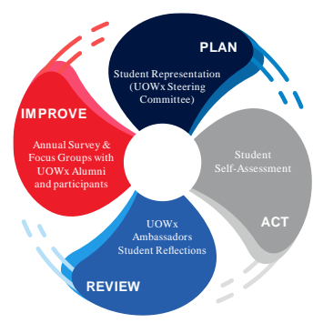
Figure 2: Student voice embedded in continuous improvement cycles.

UOWx has been purposeful in its design in embedding the student voice within its quality review cycle. This approach "is a way of thinking and practicing in higher education that re-positions students and staff as active collaborators in the diverse processes of teaching and learning – empowering students to be actively engaged in, and share the responsibility for, their own education" (Mercer-Mapstone & Marie, 2017, p. 7). When students are valued and engaged as active collaborators on projects related to teaching and learning there are positive impacts on learning, and an increased sense of leadership in, responsibility for, and motivation around the learning process (Mercer-Mapstone et al. 2017). As such, the