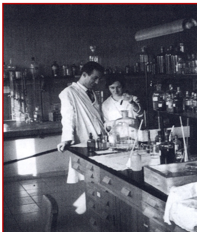
Margarita Salas and Eladio Viñuela in their CIB laboratory in 1962.